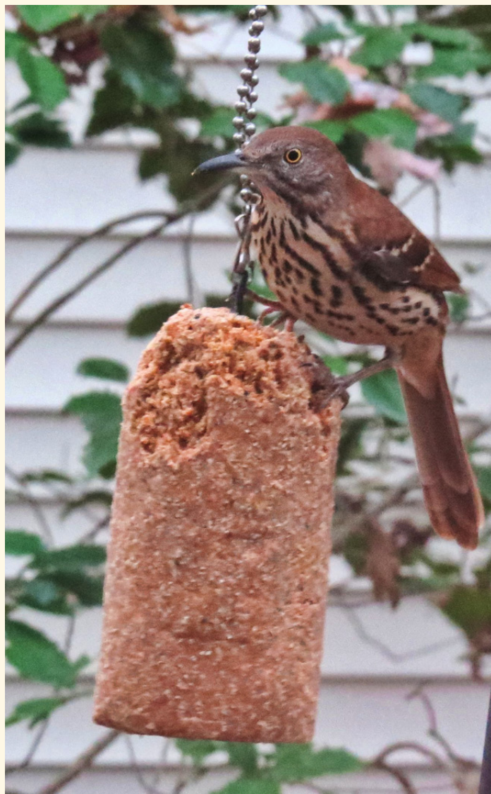
Brown Thrasher—also taken on November 18th.