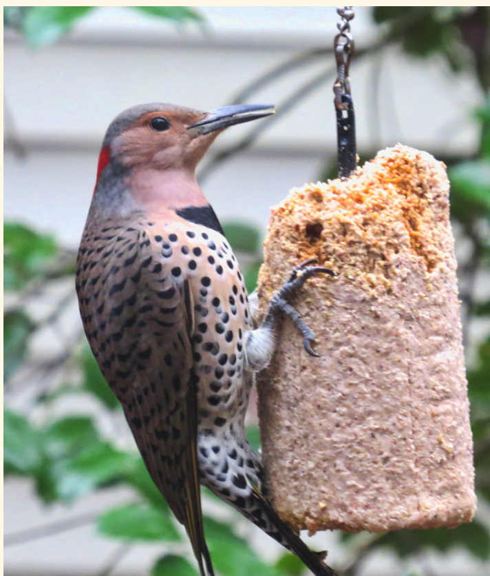
Northern Flicker—taken on November 27th.