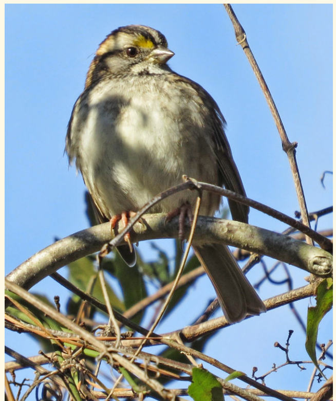
Shirley Devan took this photo of a White-throated Sparrow on November 30th at Jamestown Island