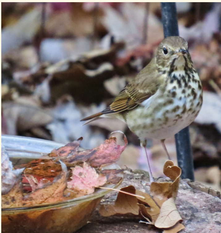
Hermit Thrush—taken on November 18th.