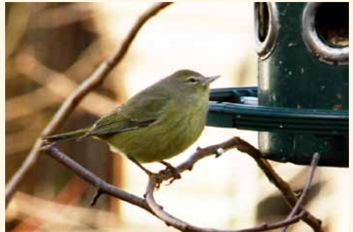
January's's photo was of aa Orange-crowned Warbler.