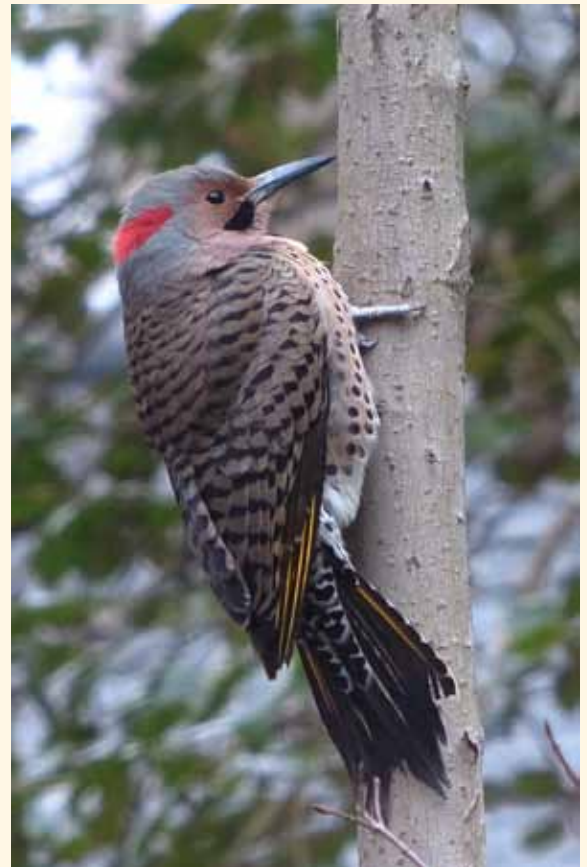
Shirley Devan sent in this Northern Flicker photo.