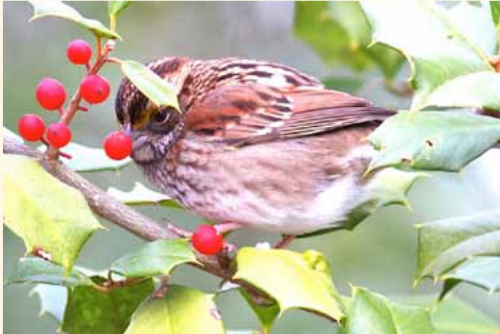
Inge Curtis called this her Red-nosed White-throated Sparrow