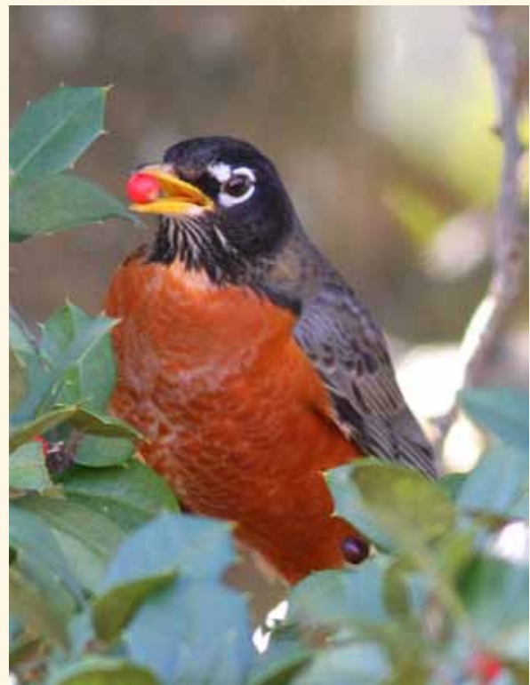
An American Robin