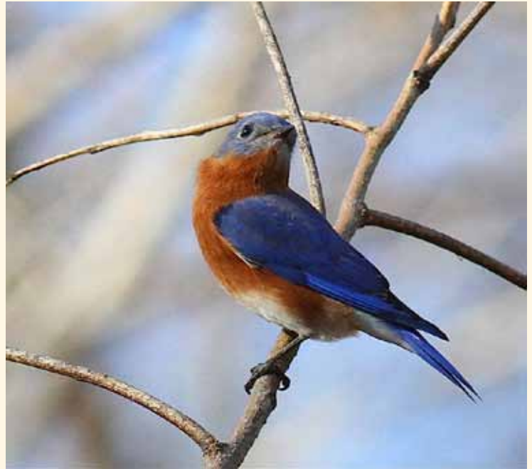
An Eastern Bluebird photographed by Inge Curtis.