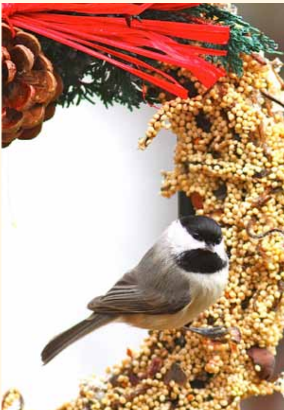
Christmas Carolina Chickadee