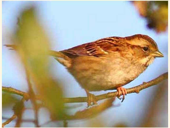
These two sparrow photos were taken by Inge Curtis during the November 10th field trip to Shirley Plantation.