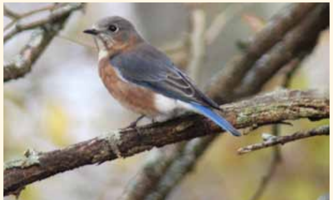
Eastern Bluebird photographed in CW by Fred Blystone.