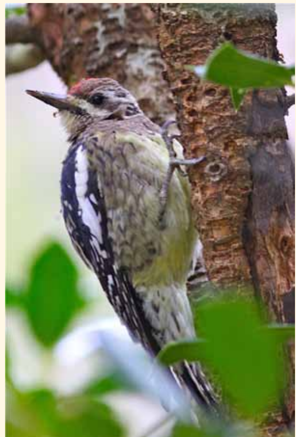
Inge Curtis took this photo of a Yellow-bellied Sapsucker