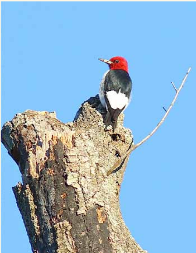
Red-headed Woodpecker