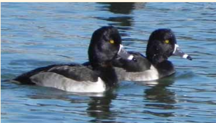
Belmont Apartments on November 11th.