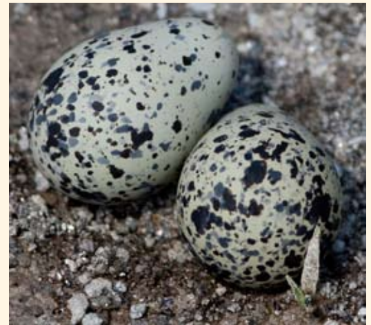
February's photo was of Killdeer eggs