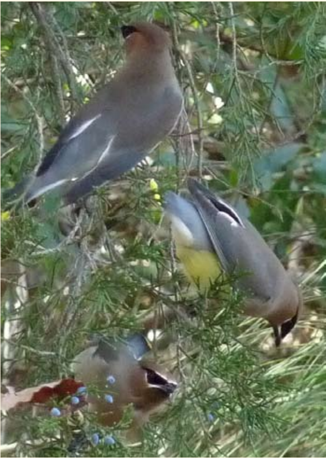
These Cedar Waxwings were photographed by Shirley Devan on Jamestown Island.