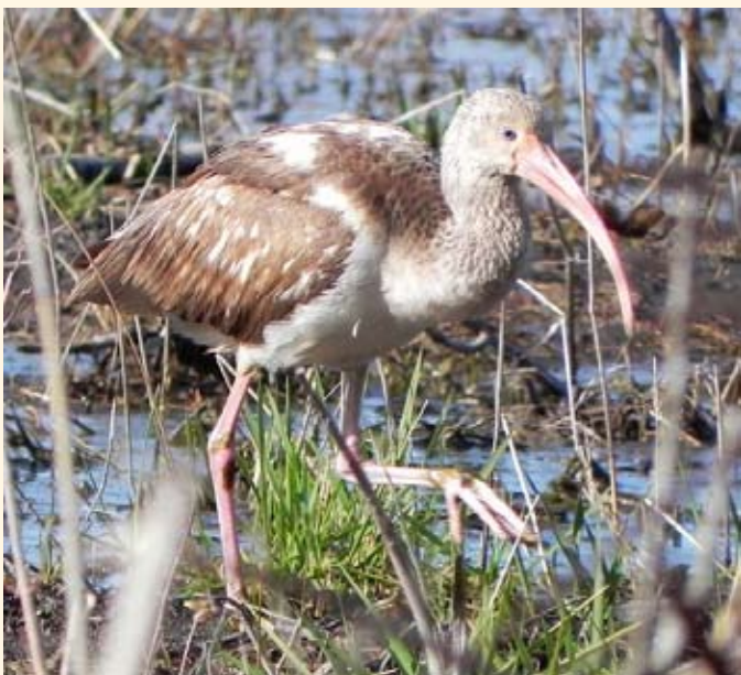
Immature White Ibis

Bodie Island had a controlled burn on Friday, but the ducks still found the lake appealing, along with a Tri-colored Heron and several American Avocets. However, the Virginia Rail feeding beside and under the boardwalk, and the Swamp Sparrow who perched nearby, inspired much whispering and pointing from birders above them. The walk to the water past the smoldering landscape flushed another Black-crowned Night-Heron with an unexpectedly large wingspan, and a Snowy Egret waited for us beside the water. Two Great-horned Owls rewarded those who lingered for the owl prowl, with one flying just over George's head.