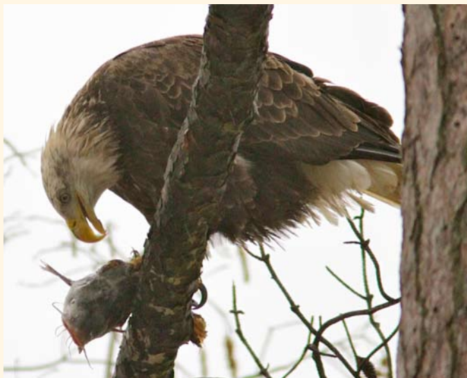
Inge Curtis caught this Bald Eagle having a fish dinner (or breakfast or lunch).