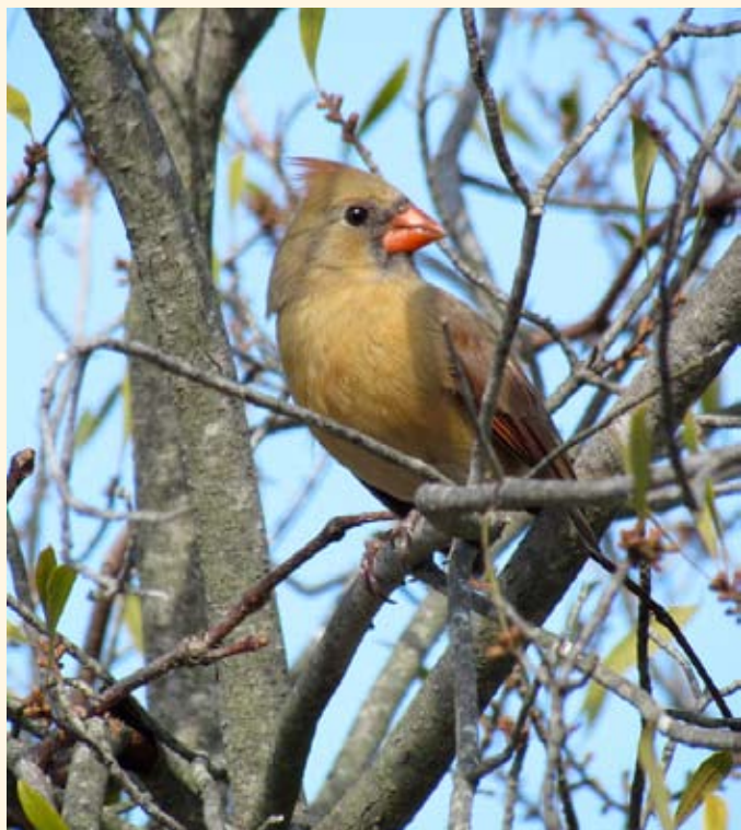
Northern Cardinal on 2/2.