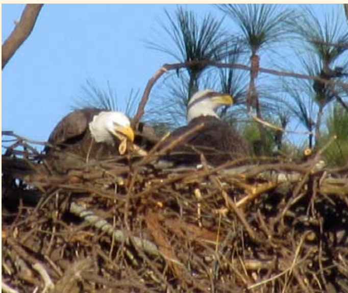
Fred Blystone took this photo of the eagles across from the Jamestown Island visitor's center on January 6.