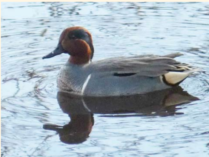
Shirley Devan took this photo of a Green-winged Teal during the "Bird Show" on January 1.