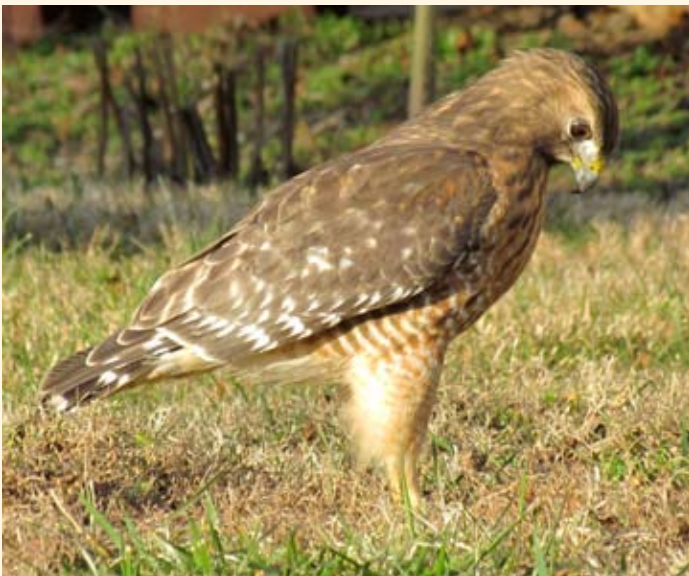
Red-shouldered Hawk photographed by Fred Blystone on January 7th on Stanley Drive.