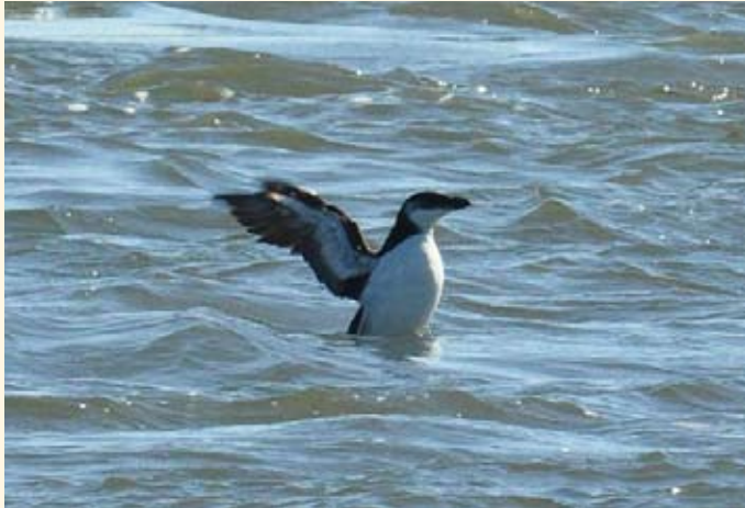
Carol O'Neil took this photo of a Razorbill at Indian River Inlet, DE on January 29th.