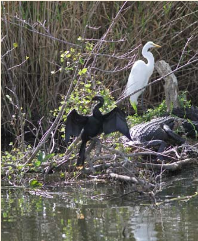
An Anhinga, a Great Egret and an alligator.