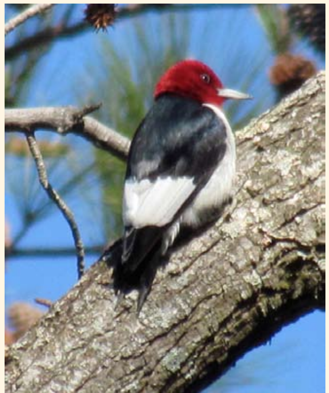
Red-headed Woodpecker January 15th on Jamestown Island.