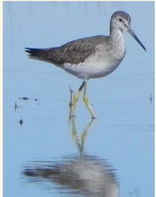
George Boyles photographed this Lesser Yellowlegs at Messick Point in Poquoson.