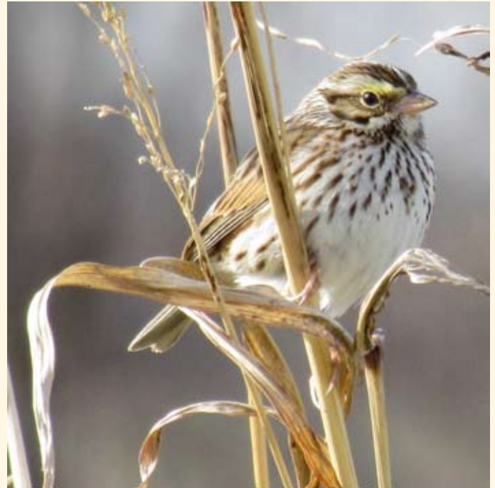
on Turkey Island Road in Henrico County on 1/16.