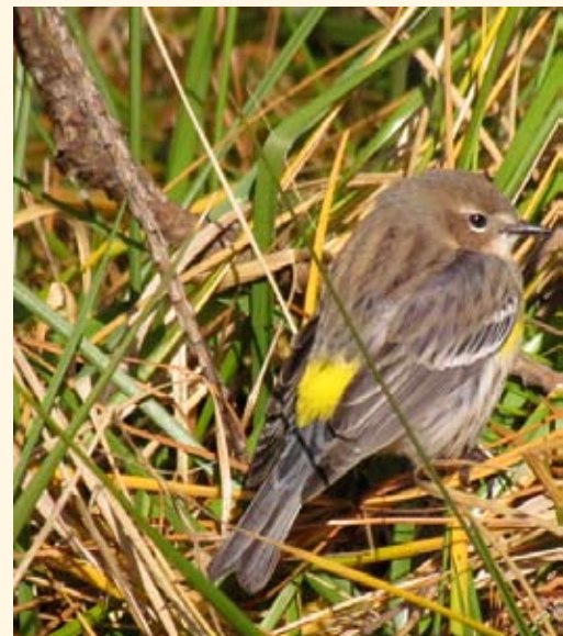
This photo of a Yellow-rumped Warbler was taken by Fred Blystone on Jamestown Island on 1/24.