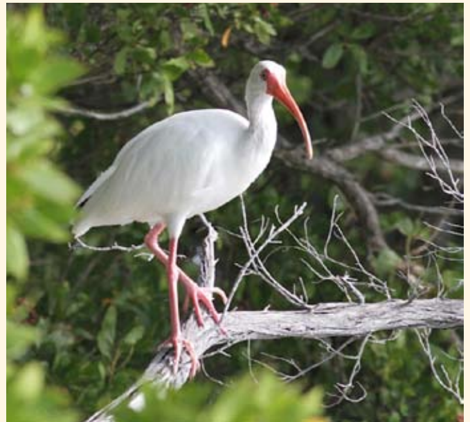
White Ibis also taken in Florida by Inge Curtis