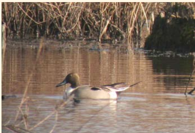
Northern Pintail during the "Bird Show" on January 1.