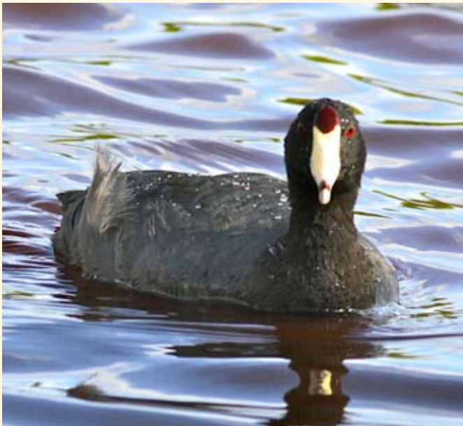
American Coot in Florida