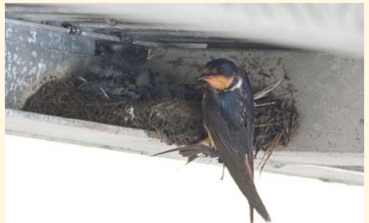
Joe Piotrowsk took this picture of a Barn Swallow feeding young at New Quarter Park, during the bird walk, on July 9th.