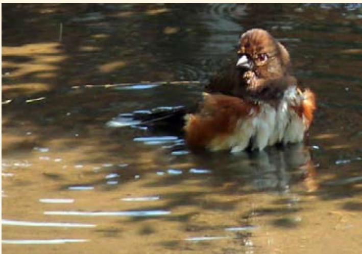
Shirley Devan took this photo of an Eastern Towhee during the bird walk at New Quarter Park on July 9th.