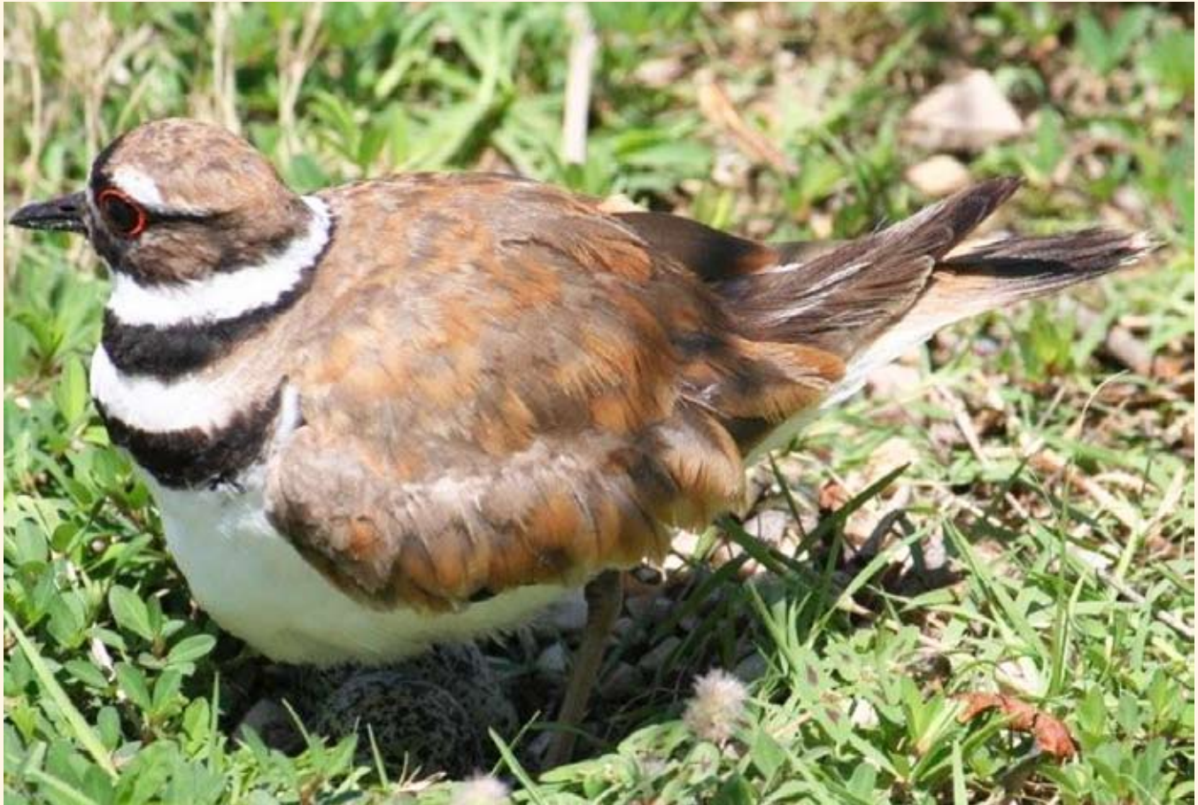
Herb Spannuth took this photo of a nesting Killdeer in front of the Archaearium on Jamestown Island on June 30th. A docent working inside the building told Herb this was the 22 day the Killdeer pair had been on the nest. (Note eggs under the Killdeer)