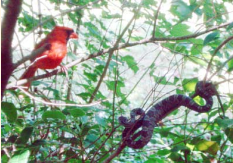
Posted by Cathy Millar on July 9th. "During this last week of daily rain, I'd been feeling sorry for a soggy looking female cardinal incubating her eggs on a nest right outside my living room window. This morning, I saw that her nest was empty but out another window saw the two cardinals and a catbird whose attentions were quietly fixed on something—a snake with a widened middle no doubt from recently eaten eggs. Light conditions were poor and I have only a point and shoot camera. The snake is a juvenile rat snake."