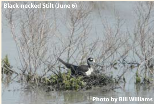
Black-necked Stilt (June 6)