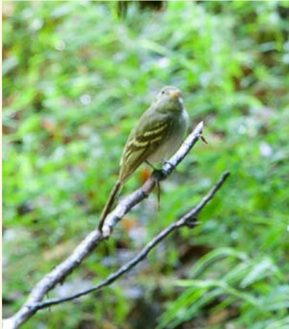
August's bird photo (taken in New Quarter Park)

This feature is only on the website and in the electronic version of The Flyer . The answer to this month's "puzzle" will be given in the next electronic newsletter, as well as on the website.