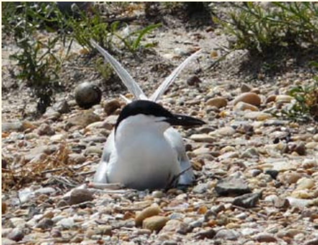
Bill Williams took this picture of a Gull-billed Tern on the Hampton Roads Bridge Tunnel on June 6th.