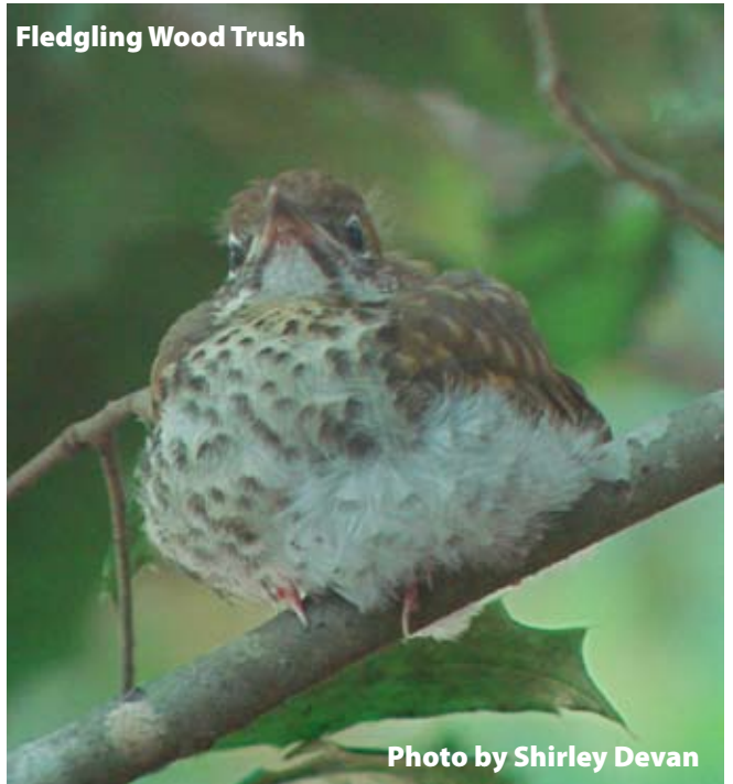
Fledgling Wood Thrush