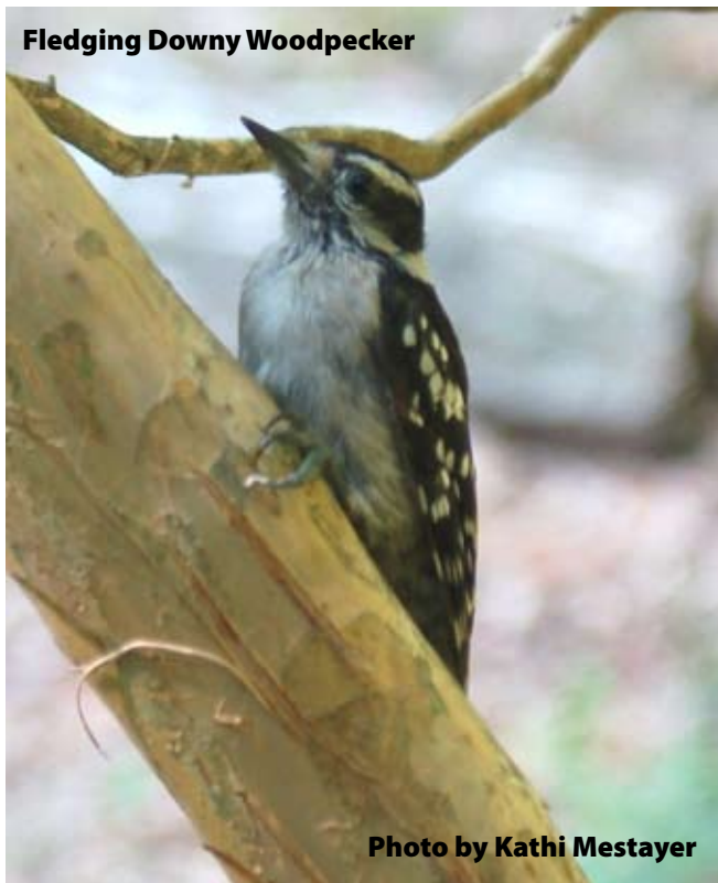
Fledging Downy Woodpecker