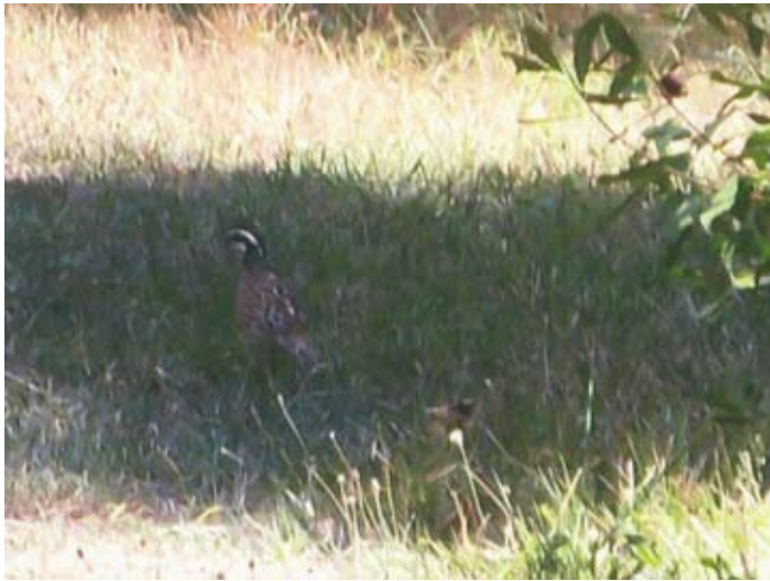
Photo of Northern Bobwhite