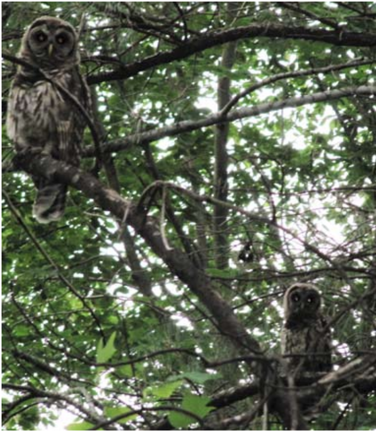
Two Barred Owl