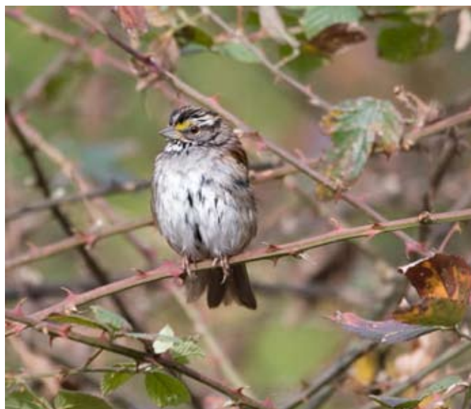
Last month's bird was a White-throated Sparrow