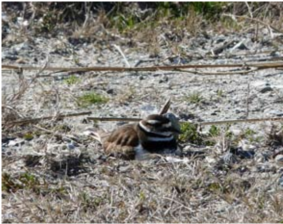
Killdeer & Killdeer eggs