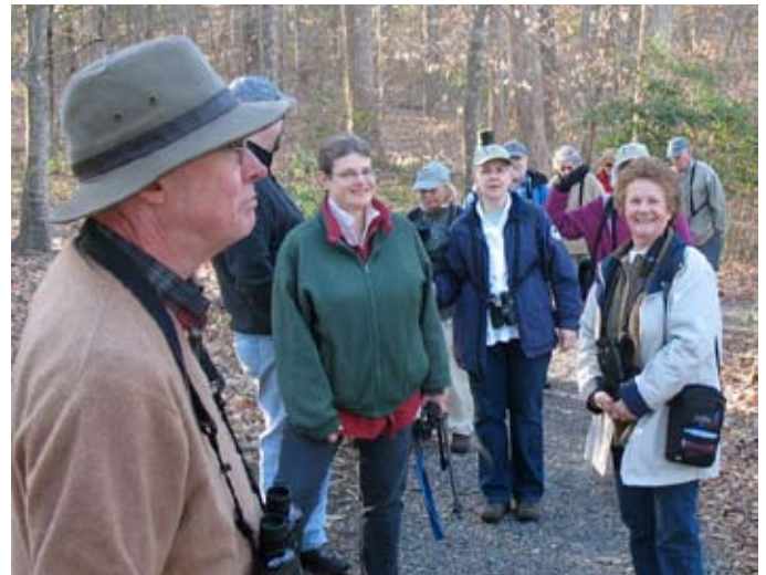
Beaverdam Park field trip