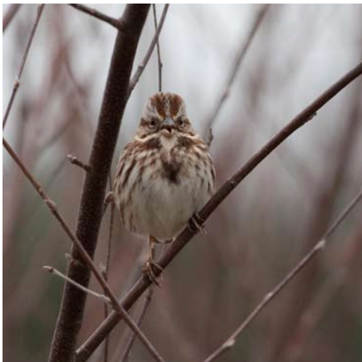
Bird for April

This feature is only on the website and in the electronic version of The Flyer . The answer to this month's "puzzle" will be given in the next electronic newsletter, as well as on the website.