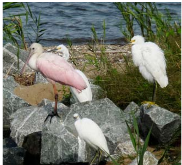
Roseate Spoonbill & Friends