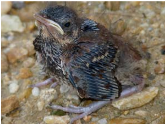
Brown Thrasher Nestling