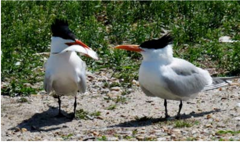
Royal Tern Courtship