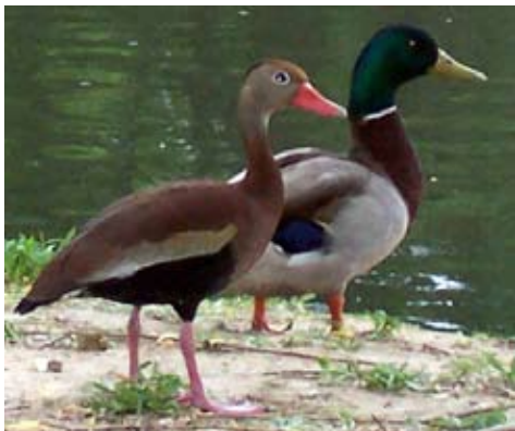
Black-bellied Whistling Duck with Mallard