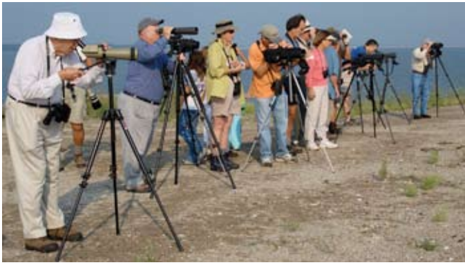
These two photos were taken at Craney Island by Shirley Devan.