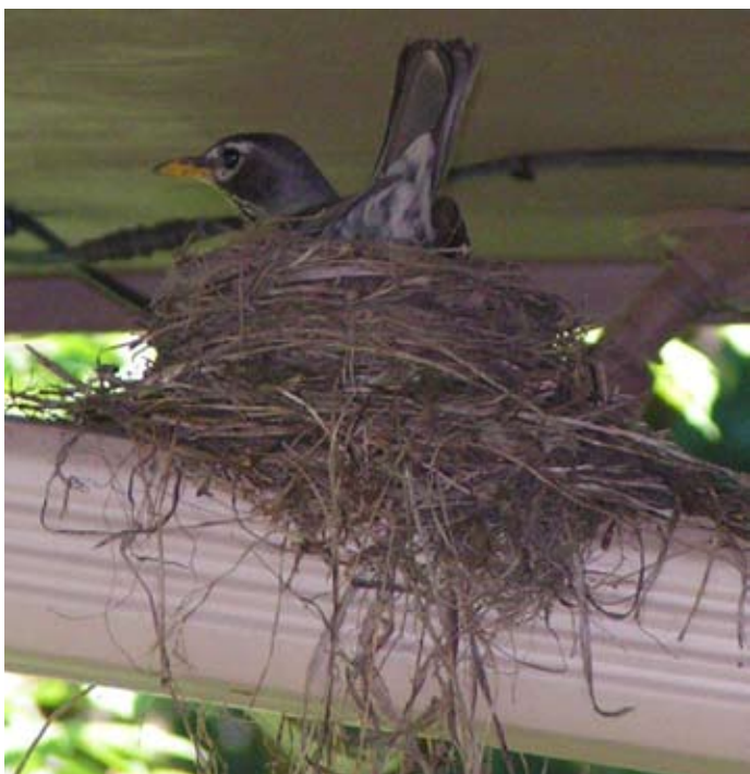
This is the photo by Brac Braclente described in Bird Sightings for May 21.