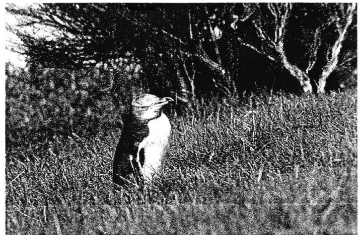
Yellow-Eyed Penguin of New Zealand

standing on a nearby hill and watched one come out of the water, cross the beach and head toward the conservation area. Additional information about the species from the above web site: Yellow-eyed Penguins gain their name because of their yellow iris and the characteristic yellow head band. They live in New Zealand and are one of the rarest penguins in the world with only about 5000 - 6000 individuals left. About one quarter of these live in the east coast of the South Island and Stewart Island. The rest live on Campbell and Auckland islands, about 600 km to the South. The Yellow-eyed Penguin is different from other penguins in many aspects of its biology and is the only penguin species that does not become tame. They originally nested in the coastal forest but their distribution is now restricted to forest remnants and coastal shrubs after extensive logging during the last 150 years.