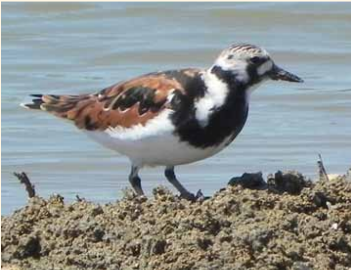
This photo of a Ruddy Turnstone was taken at Craney Island on May 9th.