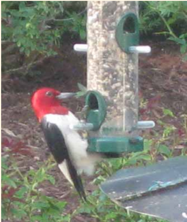
Gary Carpenter sent in this picture of a Red-headed Woodpecker that frequents one of his feeders.