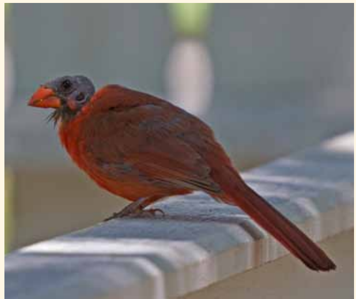
While in CW, Fred Blystone took this photo of a Northern Cardinal , who was having more than just a bad hair day.