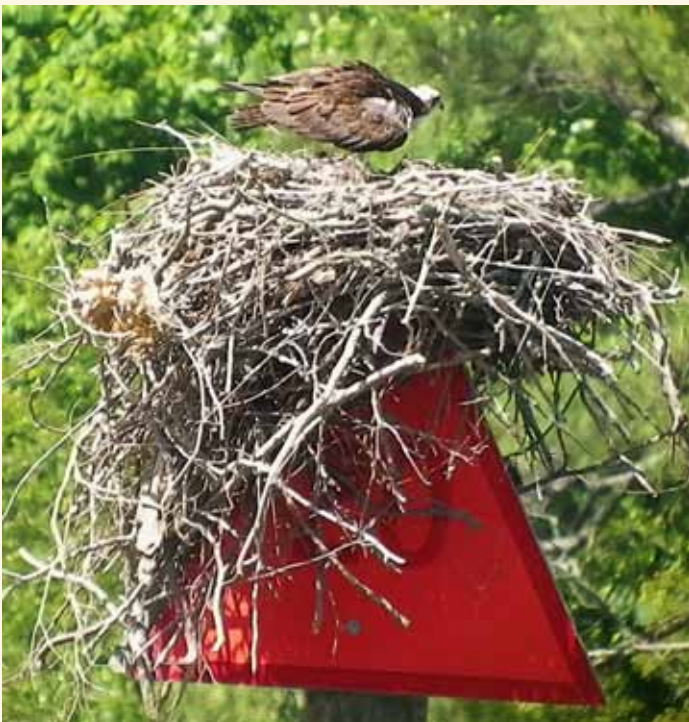
Sara Lewis also photographed the Osprey nest during the June 22nd bird walk.