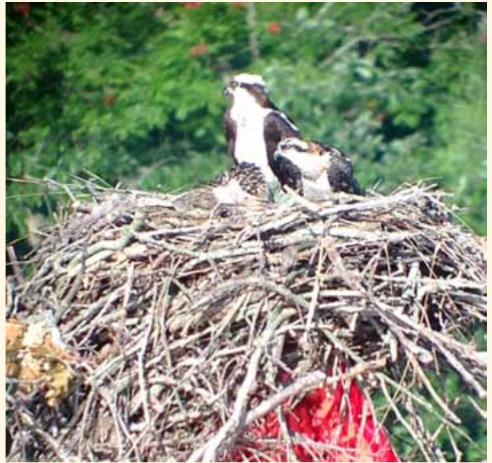
This pair of Osprey was during the June 22nd bird walk at New Quarter Park.