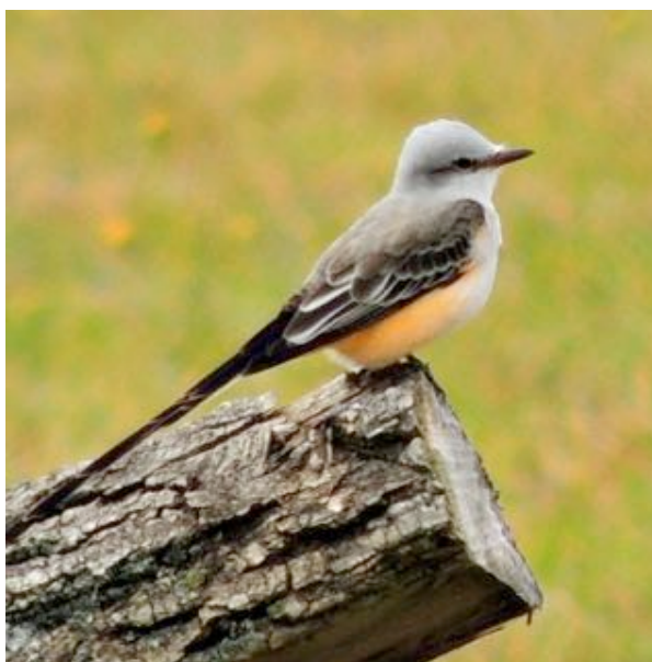
Scissor-tailed Flycatcher by Nanc Galliber November 10