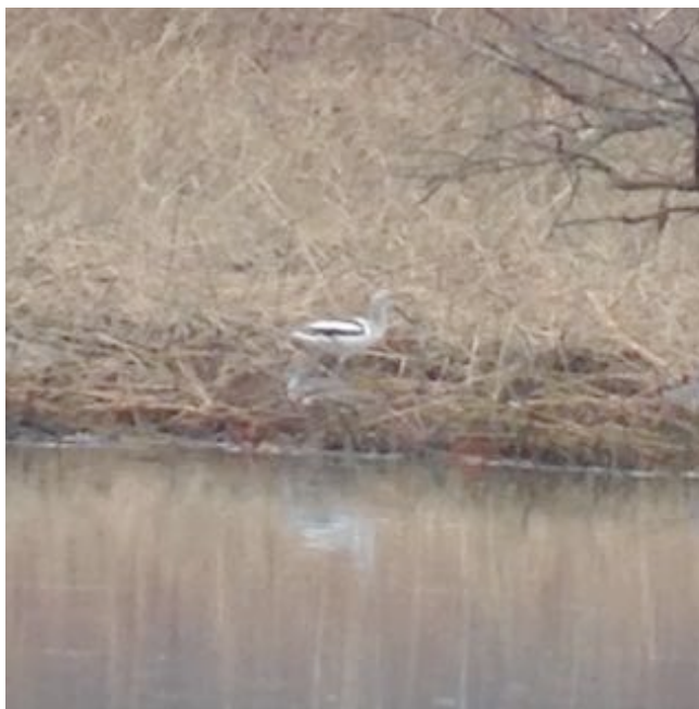
American Avocet (digiscoped), November 23