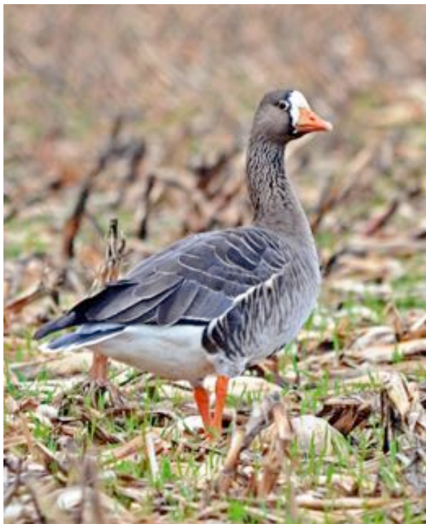
Greater-white Fronted Goose, November 9

And finally both Purple Finches and Pine Siskins have been seen and heard locally in November, raising hopes we will have these and others noted above for the December 14 Christmas Bird Count.