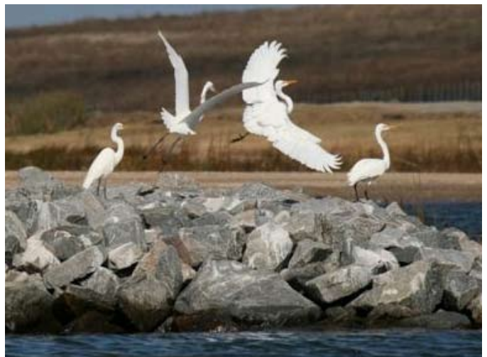
Great Egrets