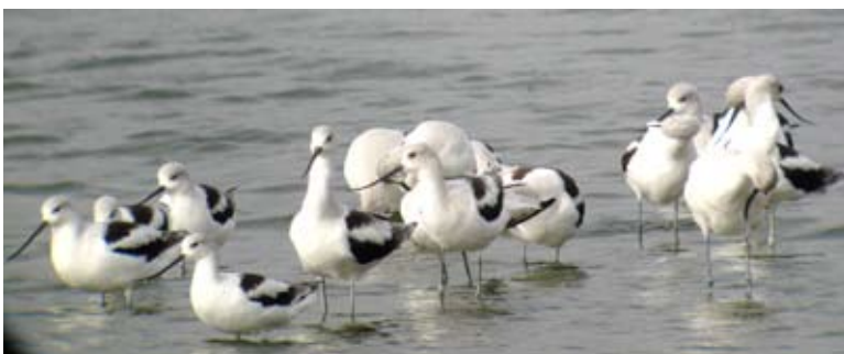
Photos of a Northern Flicker, 2 Bald Eagles and American Avocets