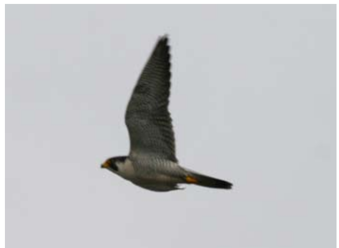
Photo of Peregrine Falcon