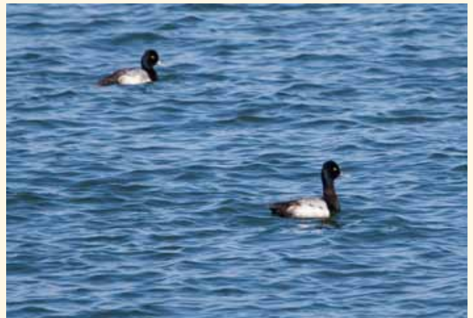
October's photo was of Lesser Scaup.