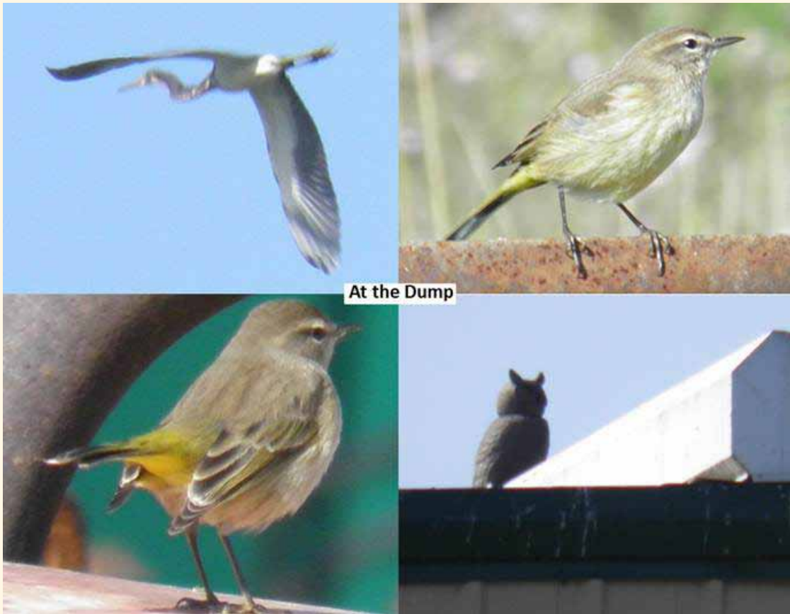
At the Dump