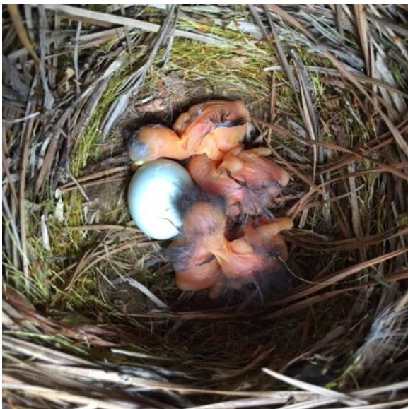
Hatch day for Eastern Bluebirds April 2016 at Newport News Park Bluebird Trail.

All credit is due to our trail leaders who organized, reported and held everything together, as well as our monitors/foot soldiers who went out on all those hot and steamy days and counted, photographed and enjoyed the new life they saw and supported.