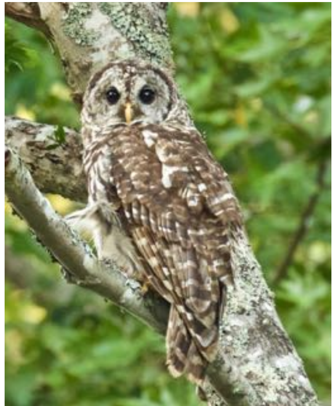
Barred Owl, September 8 on Outer Banks.