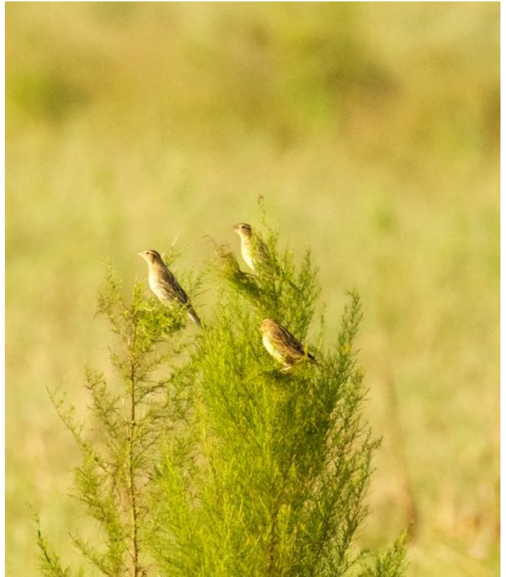
Bobolinks, September 11, Outer Banks.