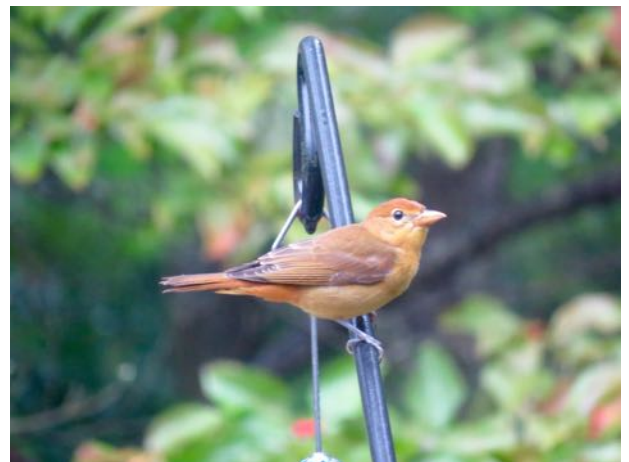
Summer Tanager at feeder station, September 21.