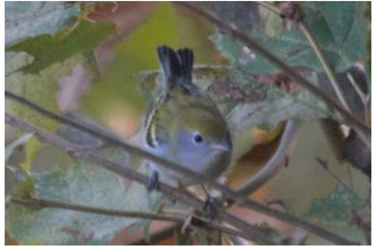
Chestnut-sided Warbler, Sandy Bottom Nature Park, mid-September.