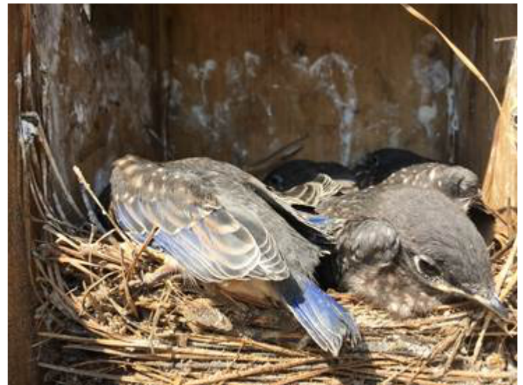
Almost ready to fledge – May 2016 at New Quarter Park Bluebird Trail.