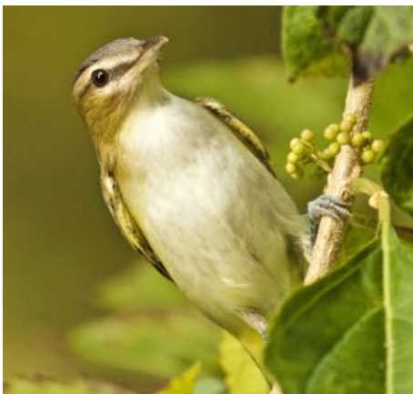
Red-eyed Vireo on Beautyberry, September 17.