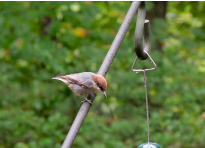
Brown-headed Nuthatch at feeder station, September 21.