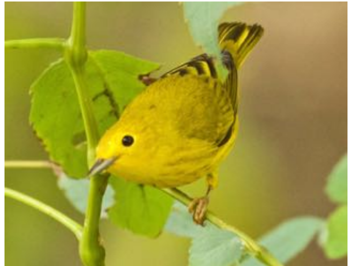
Yellow Warbler, September 17.