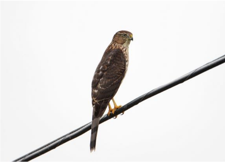
Cooper's Hawk, hatch year, at Mainland Farm, September 25.