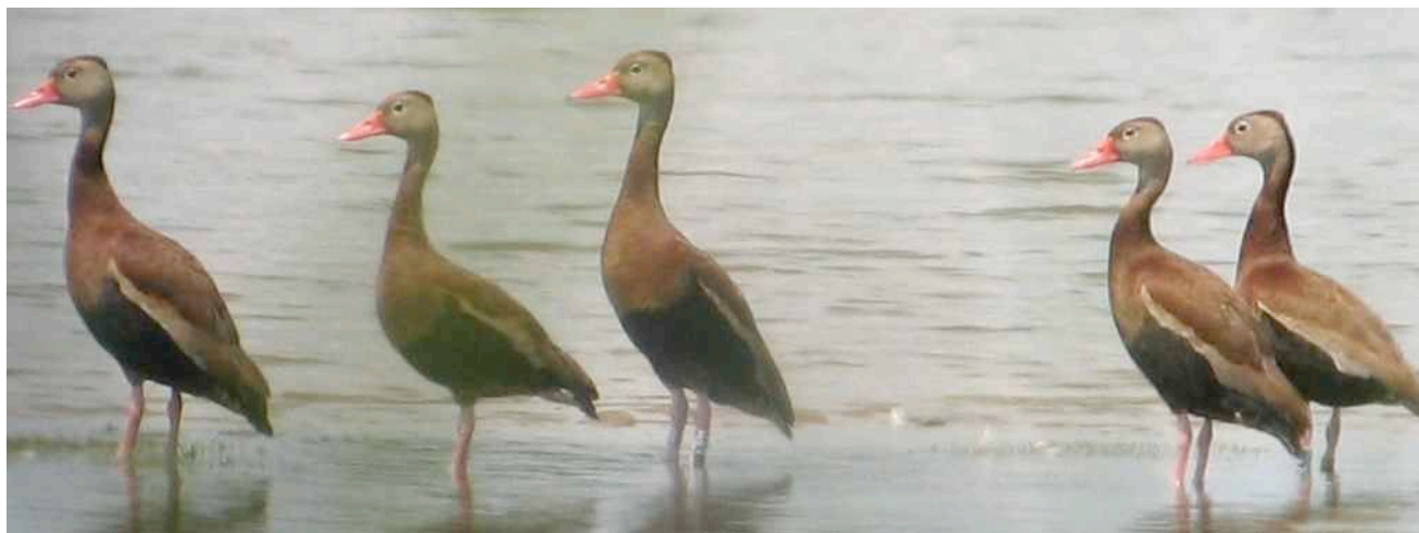
Black-bellied Whistling Ducks at Hog Island, August 6, 2014.