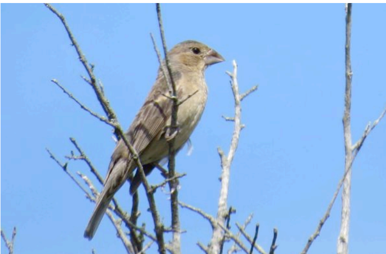
Immature Blue Grosbeak, Eastern Shore National Wildlife Refuge, September 26, 2014.