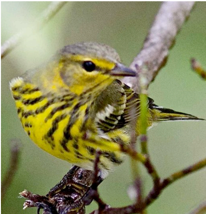
A “yard bird” – Cape May Warbler, September 11, 2014.