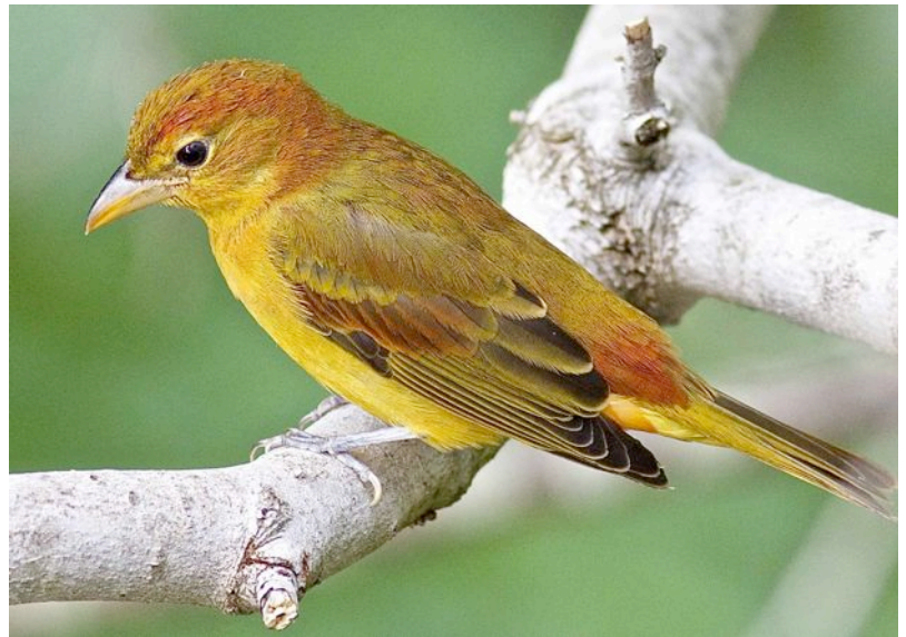
A “yard bird” – Summer Tanager, September 4, 2014.