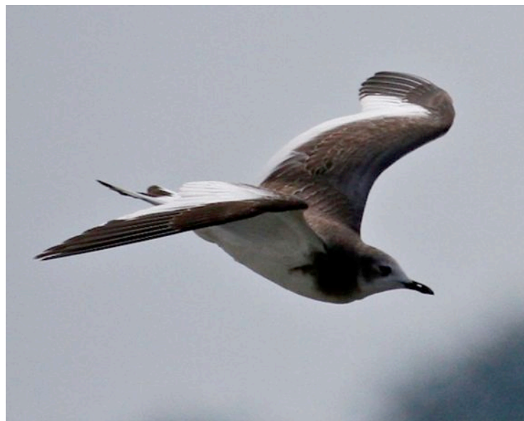
Sabine's Gull on James River, September 19, 2014.