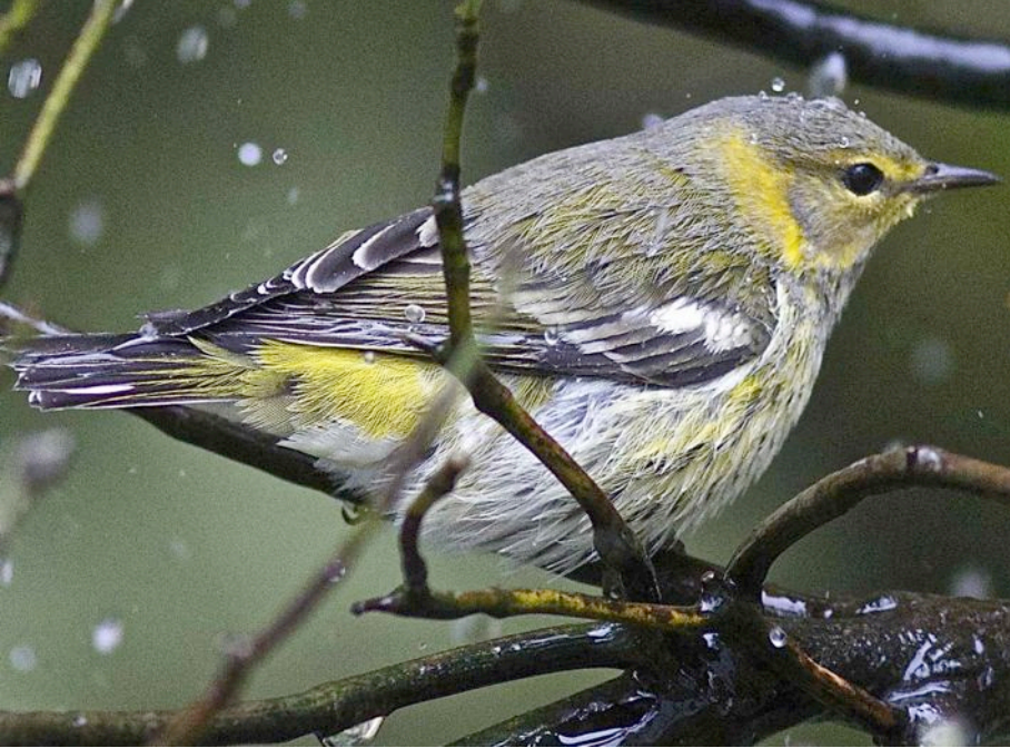
Another look at the Cape May Warbler at Inge Curtis's birdbath and water feature, September 10, 2014.