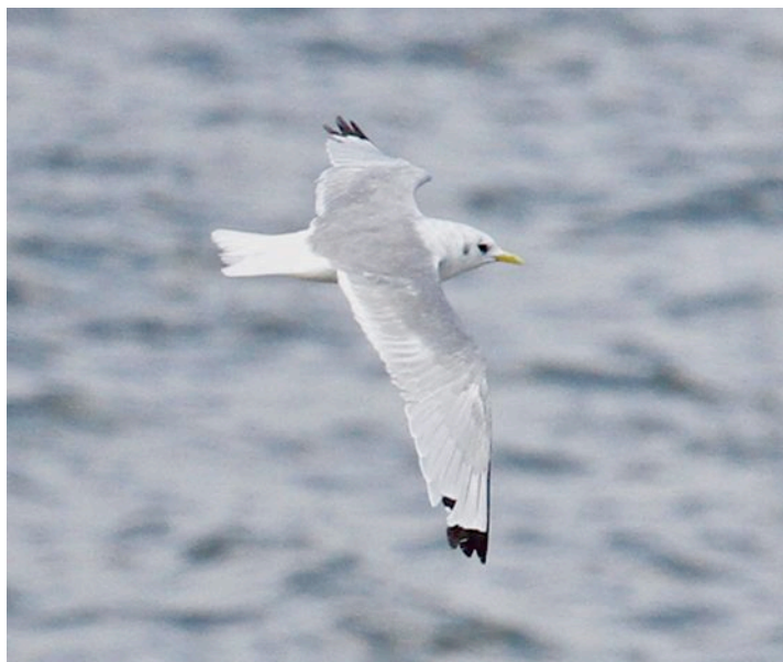
Black-legged Kittiwake on James River, September 19, 2014.

The moniker "kittiwake" is derived from the sounds the species makes. Aren't you glad you know that?