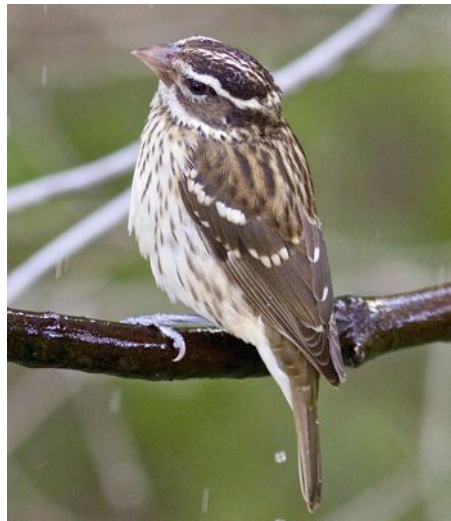
Immature Rose-breasted Grosbeak at Inge Curtis's birdbath and water feature, September 11, 2014.