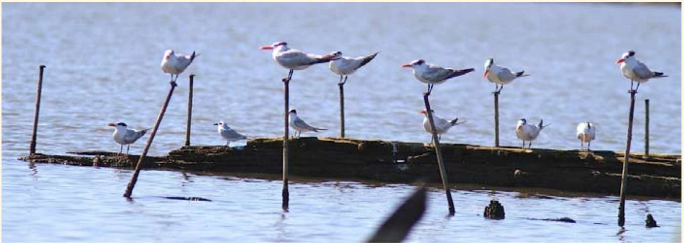
Inge Curis took this photo of terns on an old James River barge wreck on September 12th.