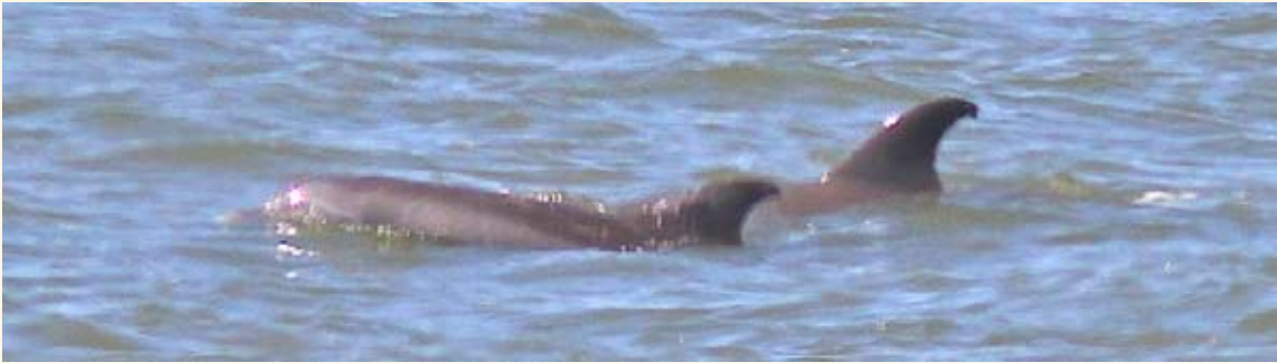
These Marble-nosed Dolphins were photographed by Inge Curtis during the Craney Island field trip.