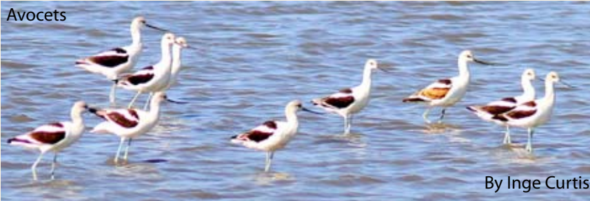
By Inge Curtis

Among the first of the particularly beautiful sights was a flock of American Avocets which flushed and flew about in spectacular synchronized formation flights several times in response to passes by hawks and harriers. The avocet flock shimmered like sparkling white tatters with black patches highlighted against green lush marshland and clear blue sky. Their graceful coordinated