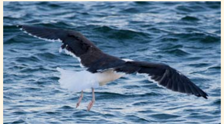
September's photo was of a Greater Black-backed Gull.