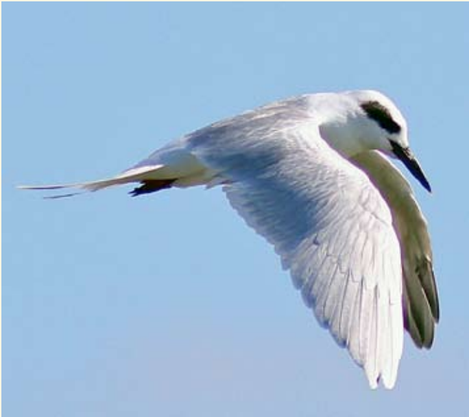
Forster's Tern photographed by Inge Curtis on September 12th.