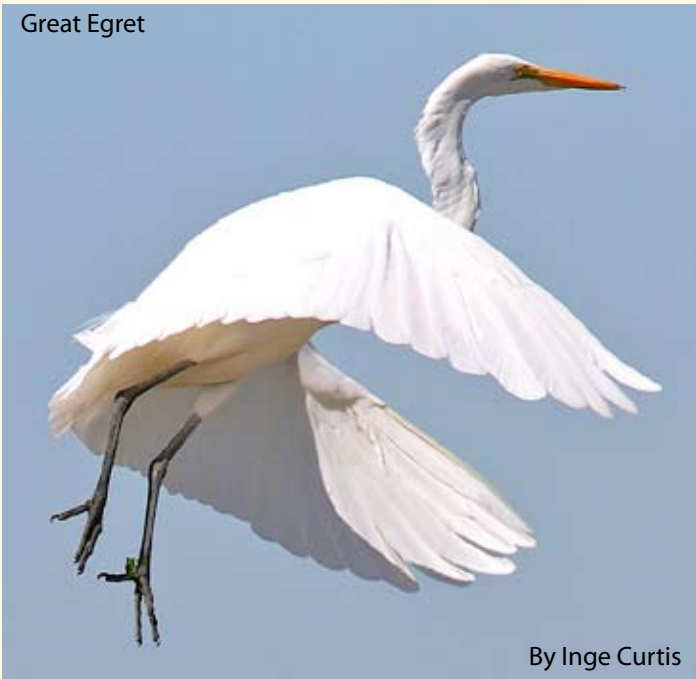
By Inge Curtis

perch. Some of the aforementioned peregrine food, a large flock of Blue-winged Teal, gave us a spectacular view close-up of a tightly clustered flock of blue-wings doing evasive maneuvers in response to the peregrinations of the distinguished diner in their midst. The mosaic of those frenzied ducks flashing gorgeous light blue wing patches en masse is one of the visual images from this day that I will never forget. The peregrine patrolled effortlessly as if she were riding herd on the large flocks of ducks, but her nonchalant air belied fixed concentration on which of the stragglers in the flocks might be breakfast.