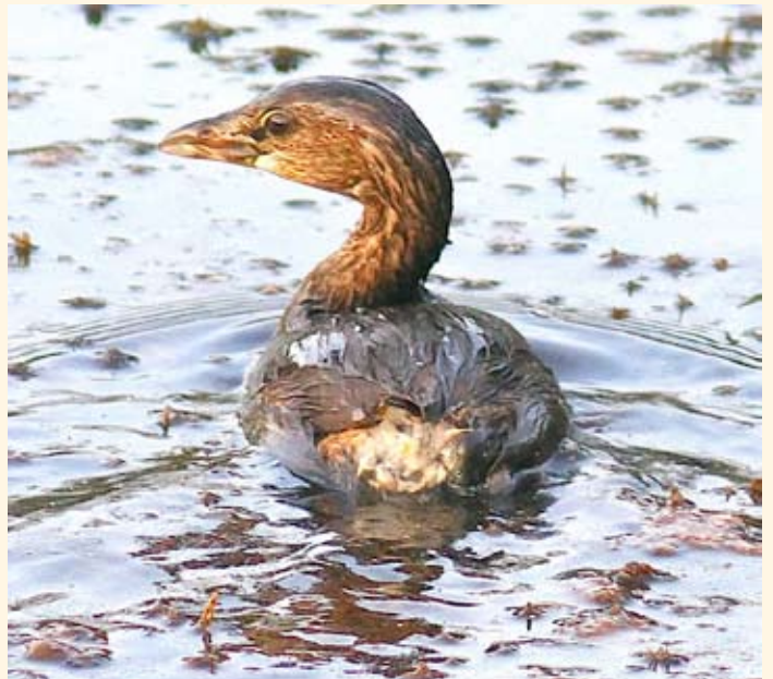
Pied-billed Grebe photographed at Jones Mill Pond on September 27th.