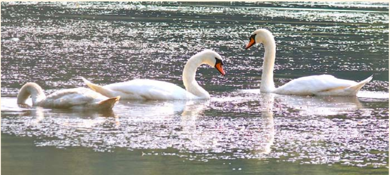
Inge Curtis photographed these three Mute Swans at Jones Mill Pond (on the Colonial Parkway) on September 27th.