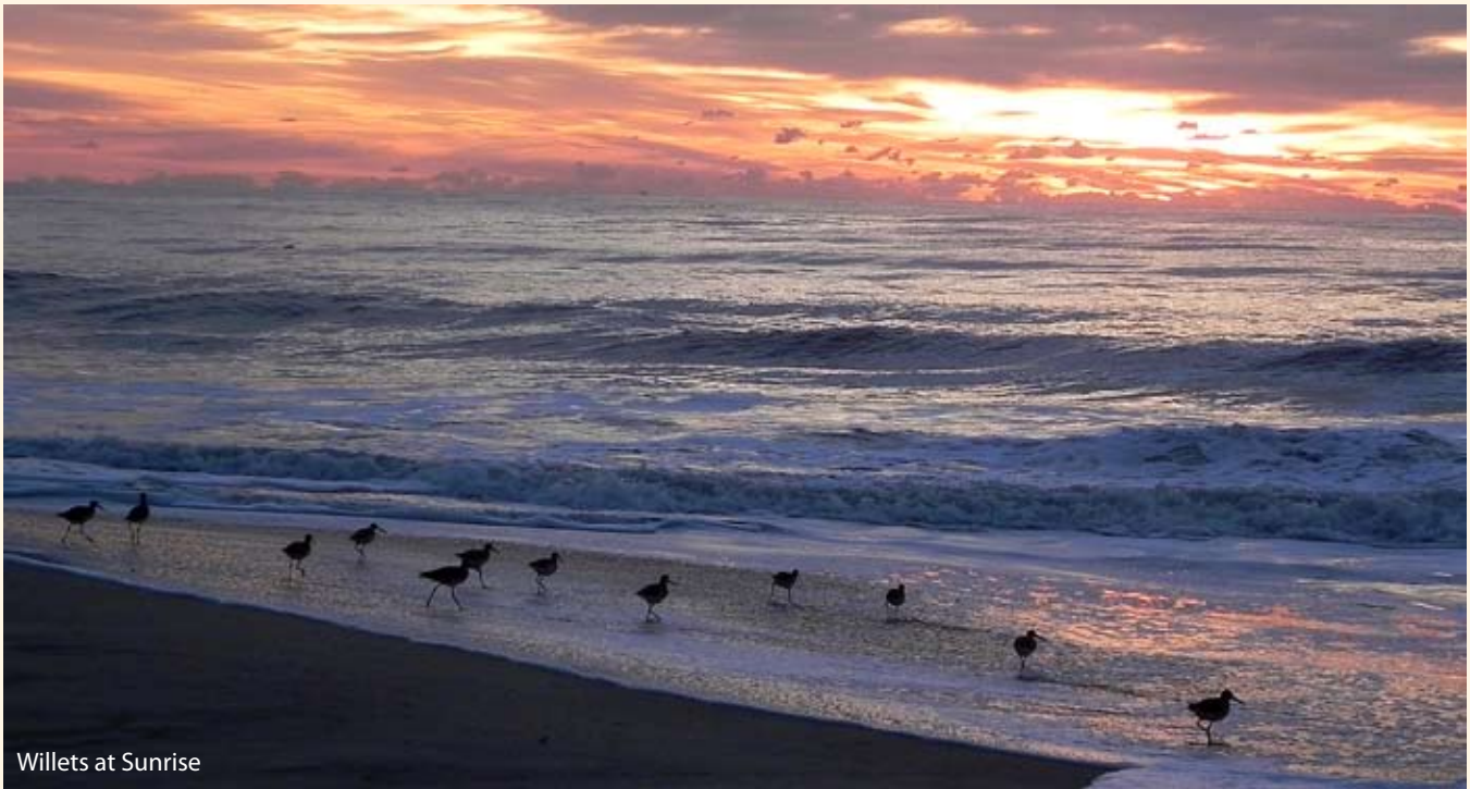
Willets at Sunrise

The weekend weather was perfect, and the birds were abundant, though we didn't take the bus trip, or participate in the formal motorcade to the beach this year. That's how the tally reached nearly the total species count from last year, over 80 pairs of eyes searching for birds in many locations.