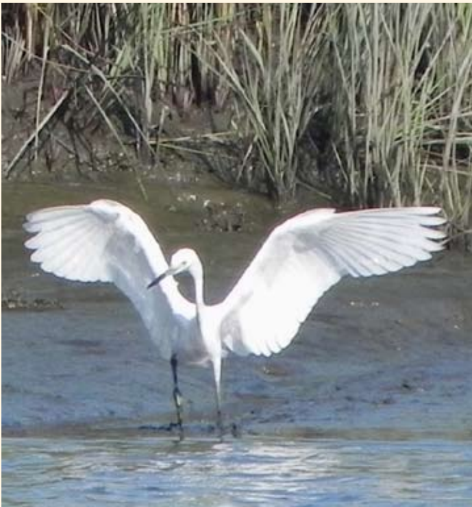
George Boyles took this photo of a Snowy Egret during the September 8th walk at New Quarter Park.