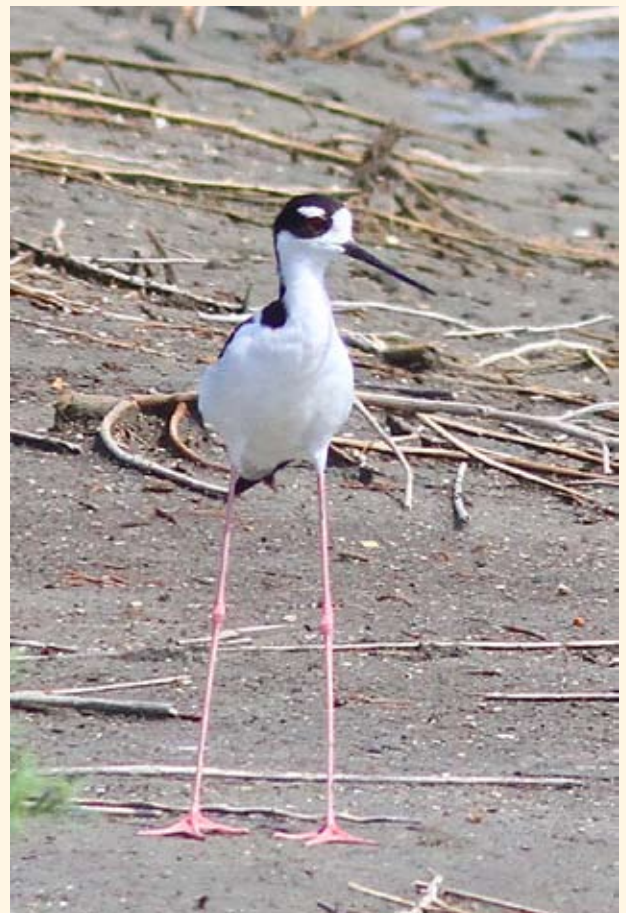
Black-necked Stilt, photographed at Craney Island on August 9th.