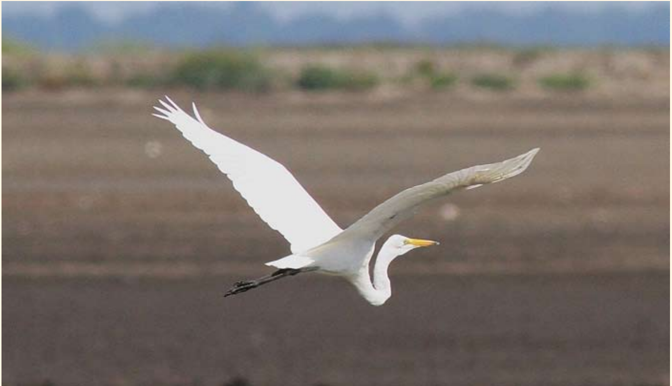
Inge Curis took this photo of a Great Egret at Craney Island on August 9th..