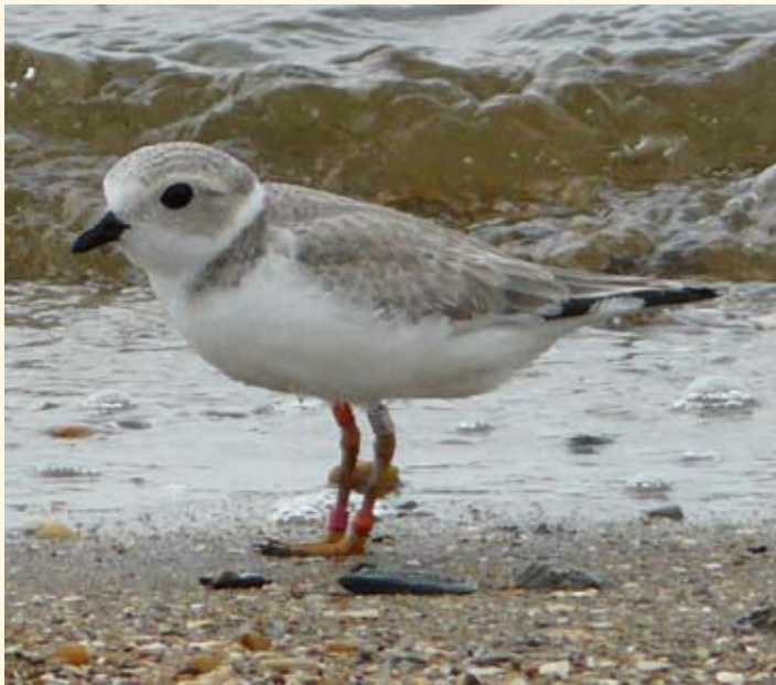
Banded juvenile Piping Plover at Craney Island on August 2nd.