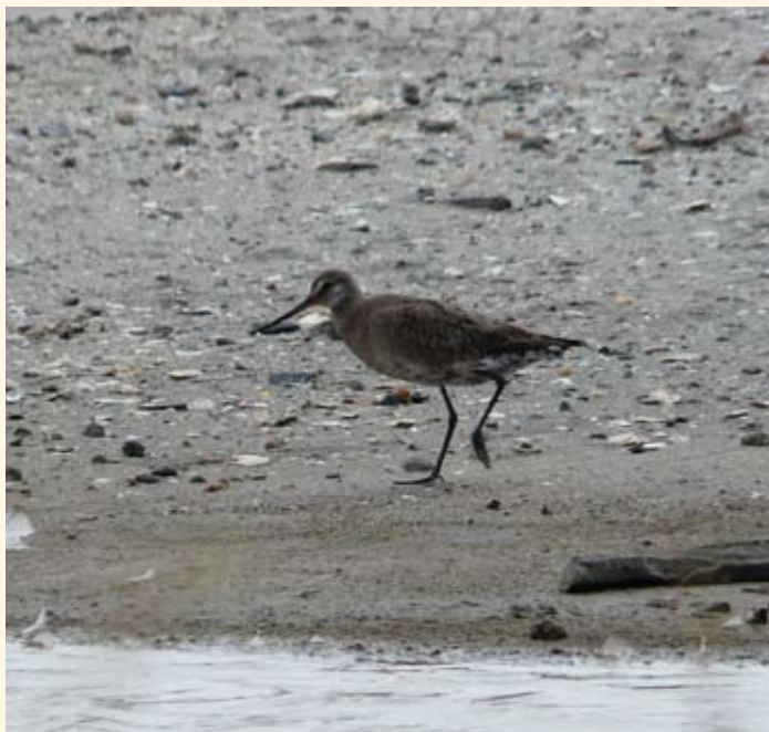
This Hudsonian Godwit was at Craney Island on August 9th.