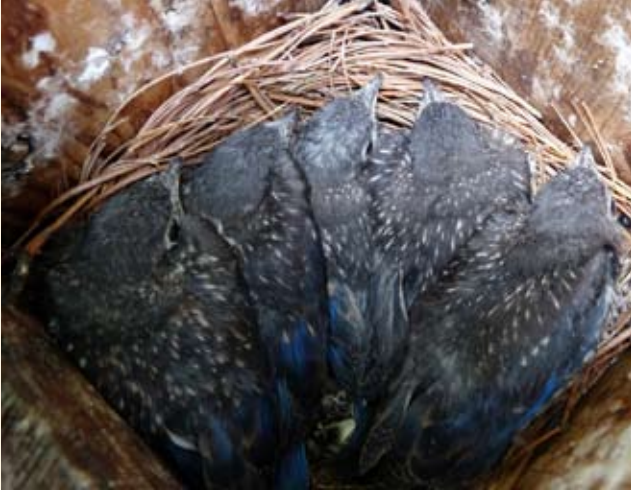
These Eastern Bluebirds were 19 days old when Shirley Devan took this photo on May 5th.