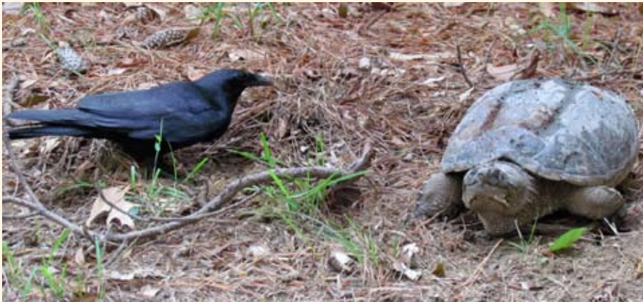
These two photos of a Crow digging for turtle eggs were taken by Fred Blystone May 17th on Jamestown Island.