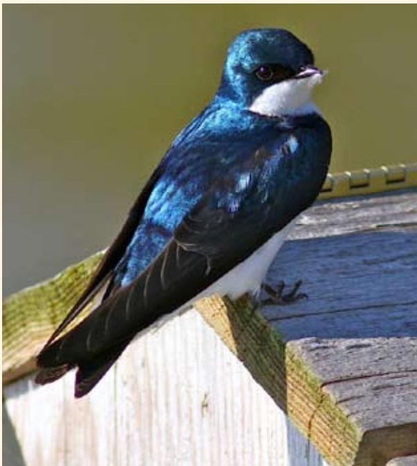
This photo of a Tree Swallow was taken on May 12th.