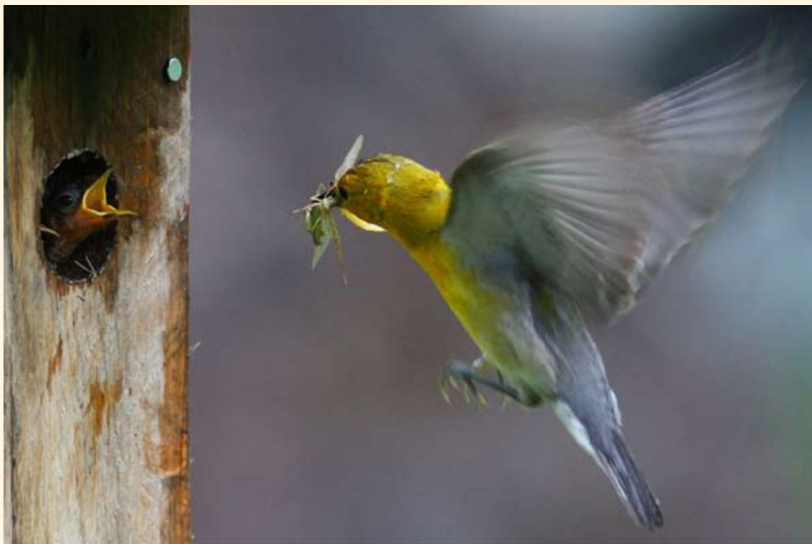
This photo of Prothonotary Warblers was taken on May 30th.