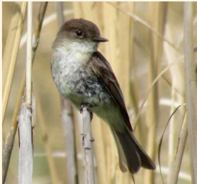
Fred Blystone took this photo of an Eastern Phoebe on Jamestown Island on May 11th.