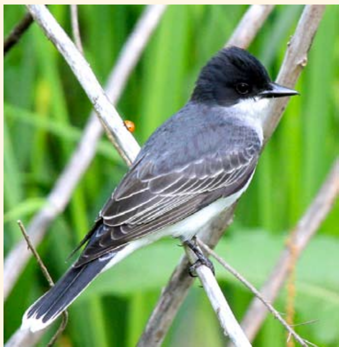
Inge Curtis took these pictures of a Prothonotary Warbler, a Great-crested Flycatcher, and an Eastern Kingbird