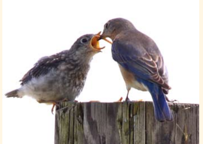
Inge Curtis took this series of photos of a female Eastern Bluebird feeding meal worms to one of its young.