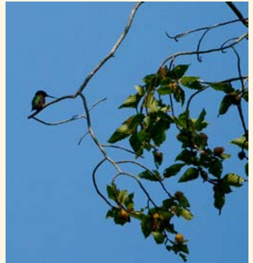
April's photo was of a Ruby-throated Hummingbird.