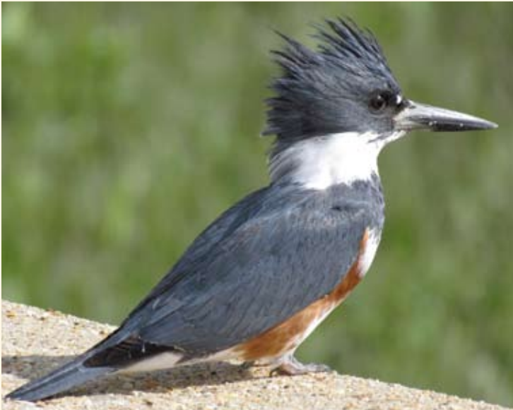
Fred Blystone photographed this Belted-kingfisher on April 12 on the bridge over Powhatan Creek on the Colonial Parkway.