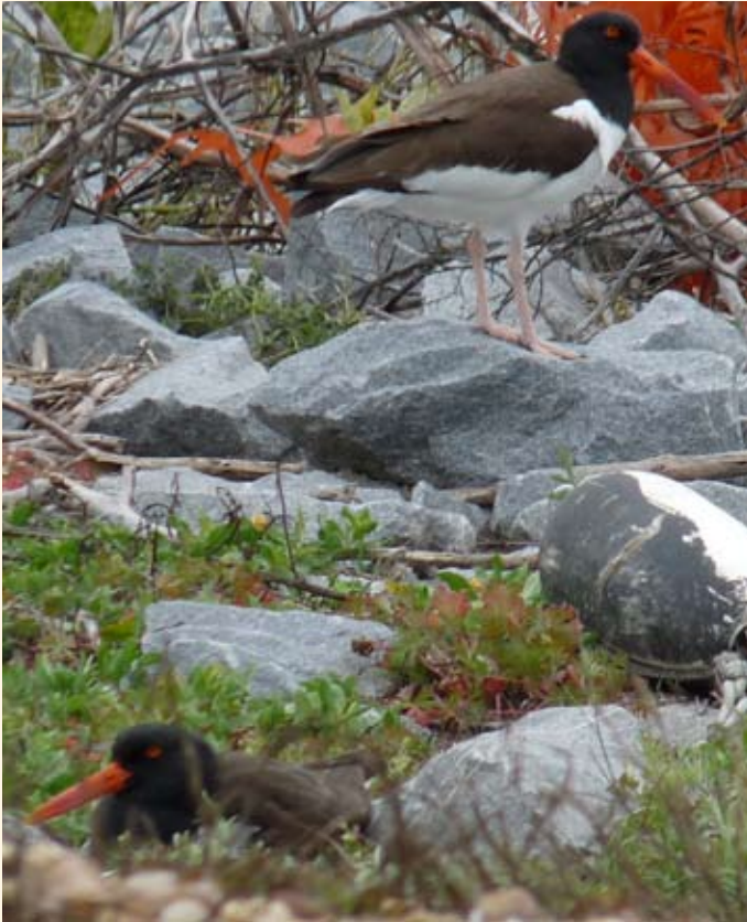
This photo of American Oystercatchers was taken on the Hampton Roads Bridge Tunnel on April 5.