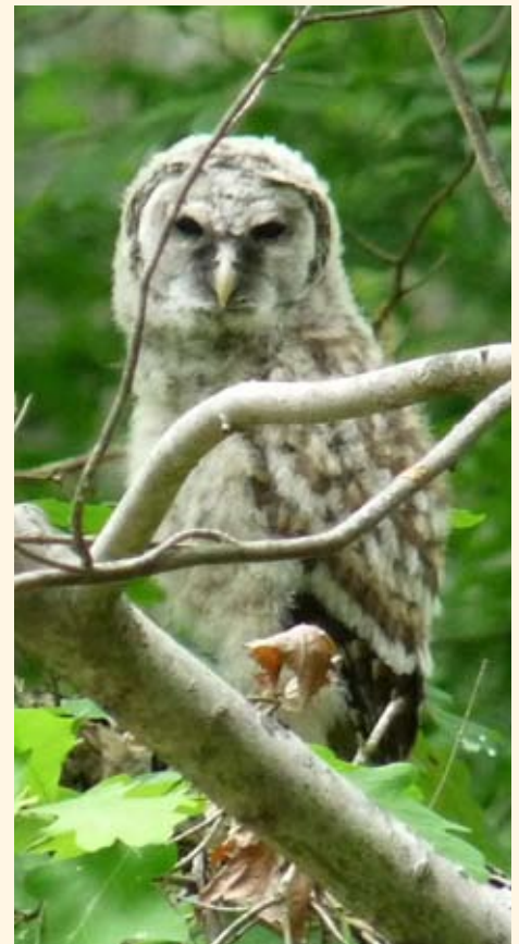
Shirley Devan photographed this young Barred Owl on Bush Neck Farm Road during the Spring Bird Count on April 29th.