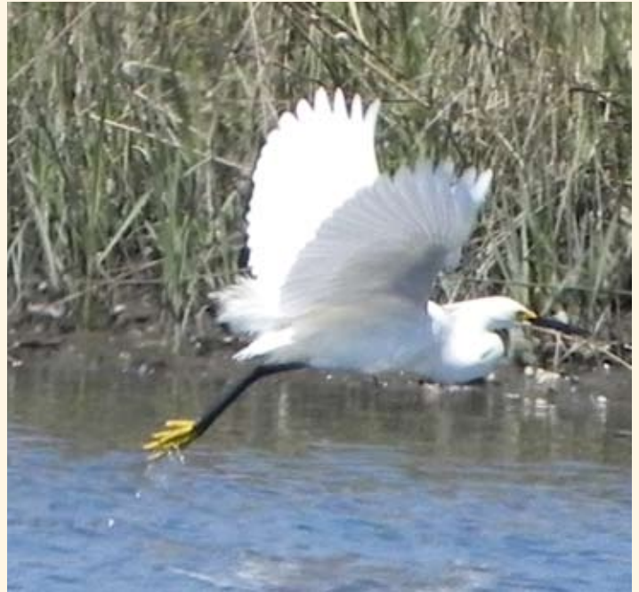
George Boyles took this picture of a Snowy Egret in Poquoson on April 13.