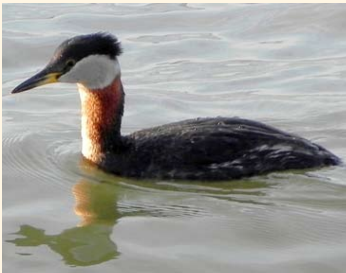
Red-necked Grebe—photographed by George Boyles on April 8 at Fort Monroe.