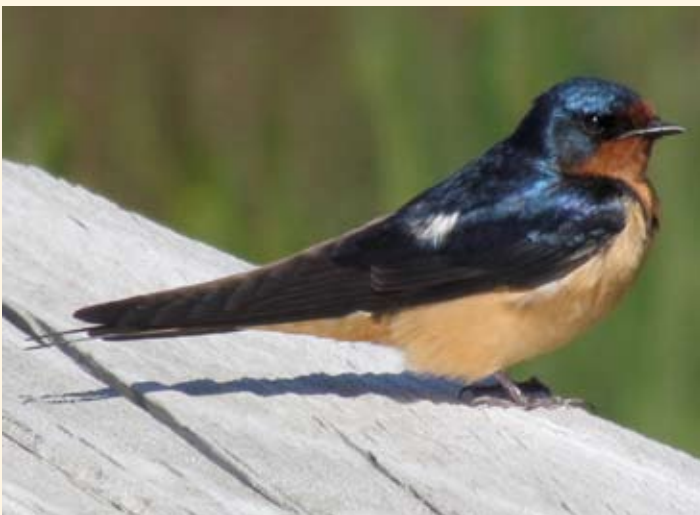
This Barn Swallow was photographed by Fred Blystone on Jamestown Island on April 12.