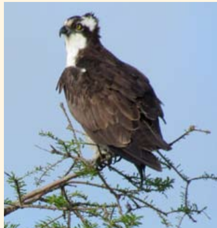
Fred Blystone photographed this Osprey on Jamestown Island on April 13.