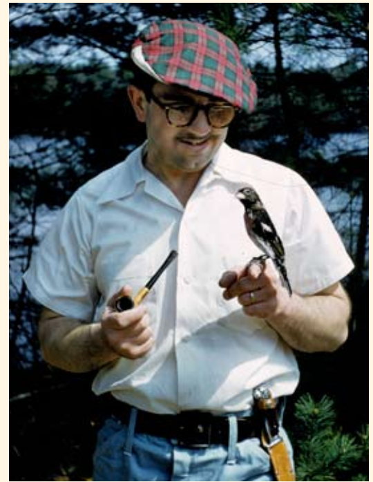
Prince and Cathy's father on the day of the release.

I've often wondered if he was successfully integrated back into the wild and found a mate. If there was an available wildlife rehabilitation center back then, we were not aware of it. We just knew that after having shared such a magical winter with us, he was no longer content to be captive.