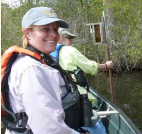
Jennifer and Sharon checking a nest box.

April 14: Bird Club members Jan Lockwood and Geoff Giles traveled down with me to check boxes. A few Prothonotary Warblers were back but most nests we checked hosted wasps! Yow! With a water sprayer and paint scraper, we dispatched the wasps and left clean boxes for arriving warblers. Soft-spoken Jan is a terror when it comes to terminating wasps. They don't stand a chance! Geoff is eager to put a line with a hook in the water to see what comes up!