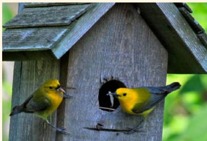
Inge Curtis took these pictures of a Cedar Waxwing, a Blue Jay and a pair of Prothonotary Warblers.