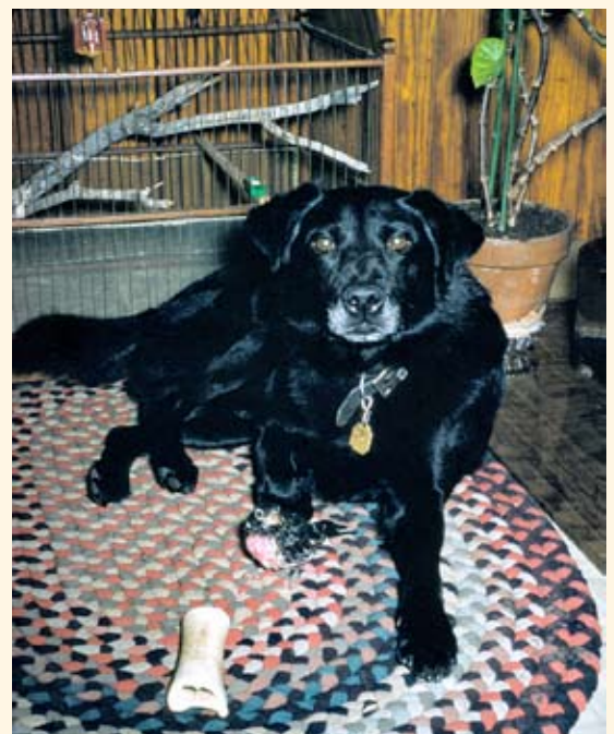
Prince and King share some quality time.