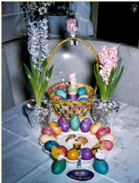
Prince adds a finishing touch to the Easter basket.

“All right, it’s time to pick the birds”, my father exclaimed and then realizing what he’d just said, blurted “I mean the pears!” The year was 1956 in Lawrence, Massachusetts and I was 7 years old. That morning at breakfast, my father had announced that when I got home from school, we would pick the pears from the big old tree in our side yard. Harvesting fruit was always a pleasurable family affair, but I detected an added air of excitement this time. Realizing that he’d already said too much, my father gave in and brought out the surprise he’d intended to show me after the pears had been picked. It was a young rose-breasted grosbeak! Presumably it was on its first migratory flight south when it landed on the ground in our yard with a sprained wing. Our seven-year-old part- Labrador dog, King, had brought my Dad’s attention to the injured bird sitting in a pile of leaves. The bird had the brownish chest with just a blush of pink of an immature male. We named the bird Prince and put him in a large bird cage to recover. However, by the time his wing had healed and he could fly again, winter had set in and Prince had to stay.