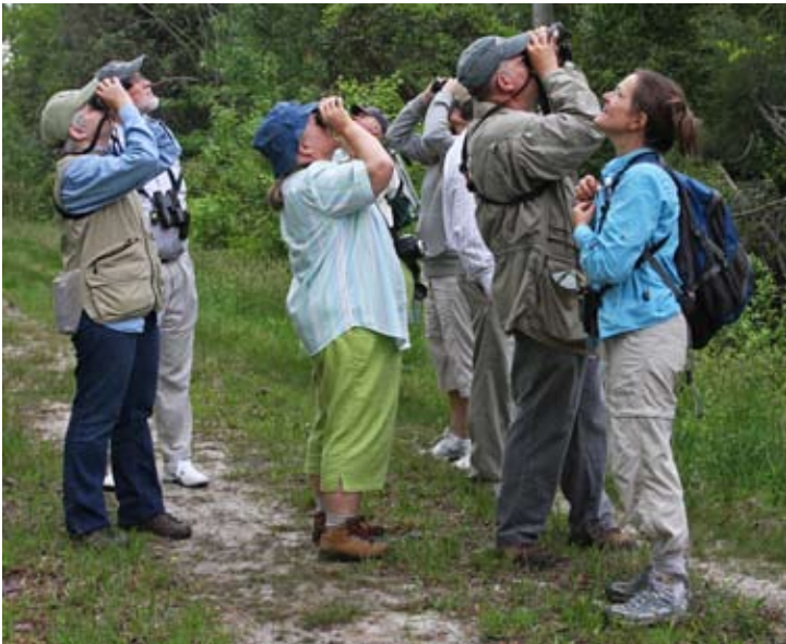
Two group photos from Dismal Swamp Field trip