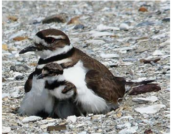
Killdeer with chick