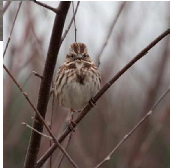
Last month’s bird was a Song Sparrow.