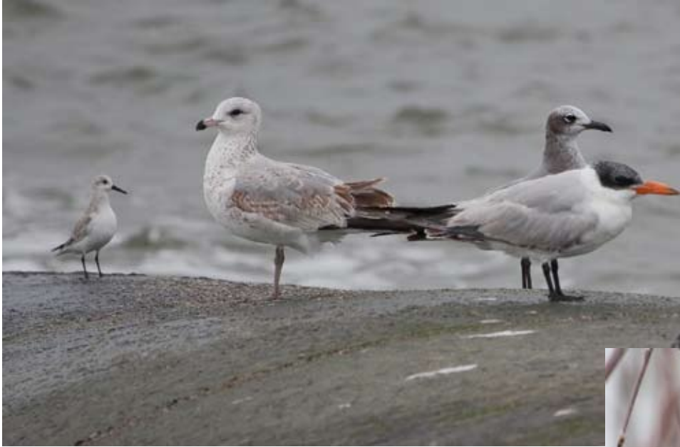
Birds for May

This feature is only on the website and in the electronic version of The Flyer . The answer to this month’s “puzzle” will be given in the next electronic newsletter, as well as on the website.