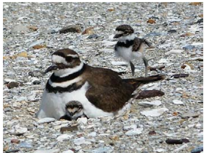
Killdeer with two chicks