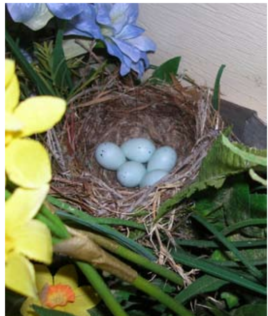
House Finch Nest