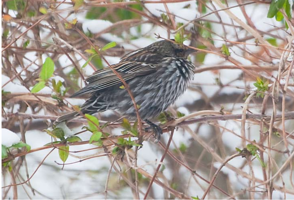
Mystery Bird for May