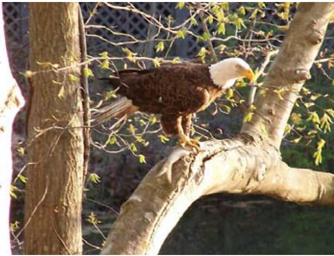
Bald Eagle (with fish)