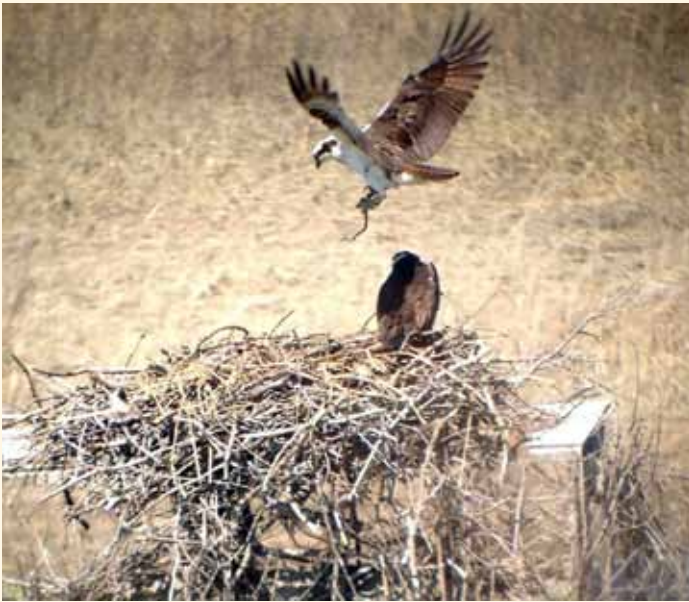
Both of these were taken by Shirley Devan. The Osprey photo was taken March 19th at Chickahominy Riverfront Park. The photo of the Black-tailed Godwit was taken at Chincoteague on March 21st.