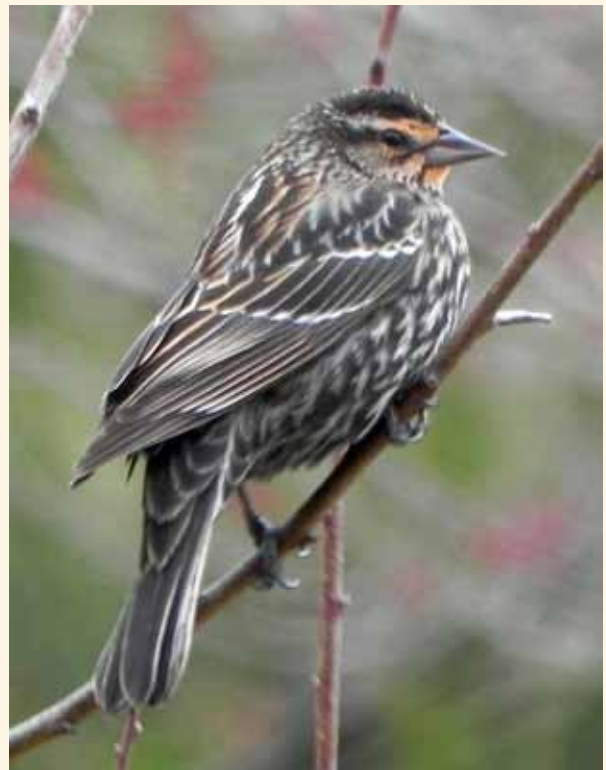
Virginia Boyles sent in this photo of a Red-winged Blackbird.