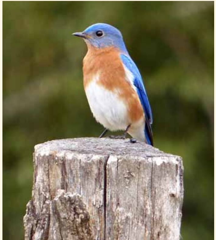
Eastern Bluebird photographed by Shirley Devan.