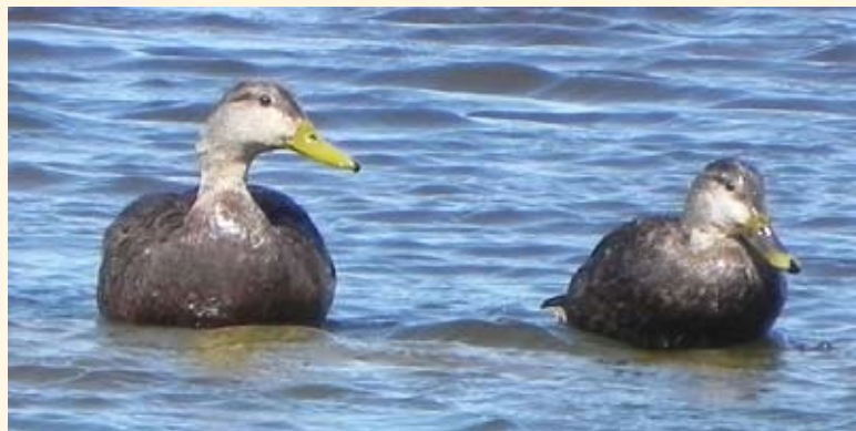
This photo of American Black Ducks was taken at Chincoteague/Assateague.