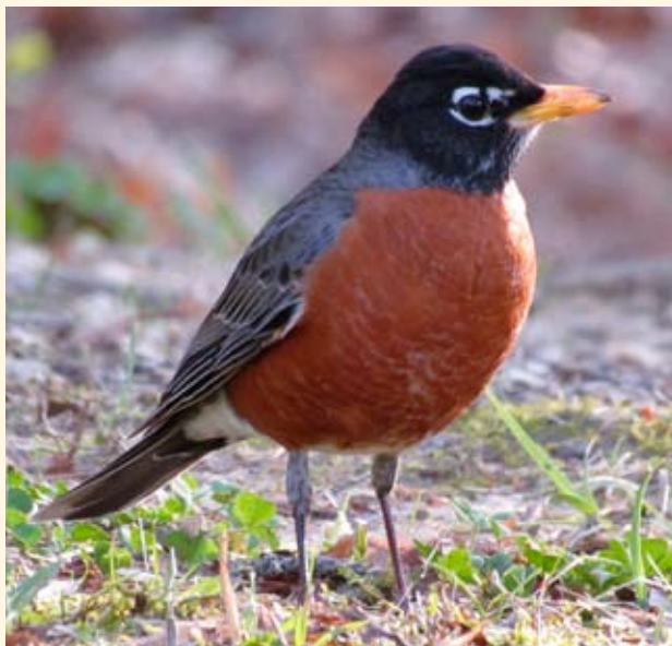
American Robin— on the Colonial Parkway.