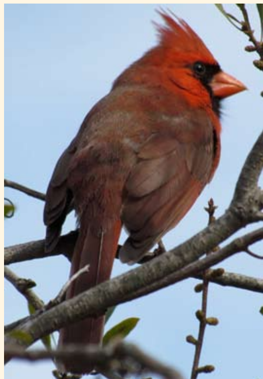
Fred Blystone took this photo of a Northern Cardinal on March 2.