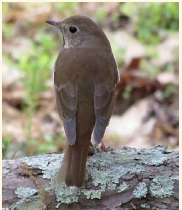
Fred Blystone photographed this Hermit Thrush on the loop road on Jamestown Island.