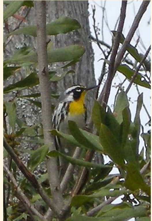
Carol O'Neil photographed this Yellow-throated Warbler March 16th on the Cypress Isle in Governor's Land.