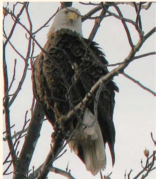
Bald Eagle, during the February 26th walk at New Quarter Park.