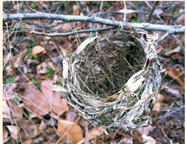
Photo of last year's nest on February 24 near the WISC multi-use trail.