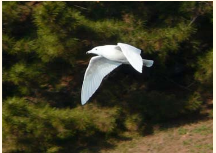
Glaucous Gull, at Rudee Inlet on February 18.