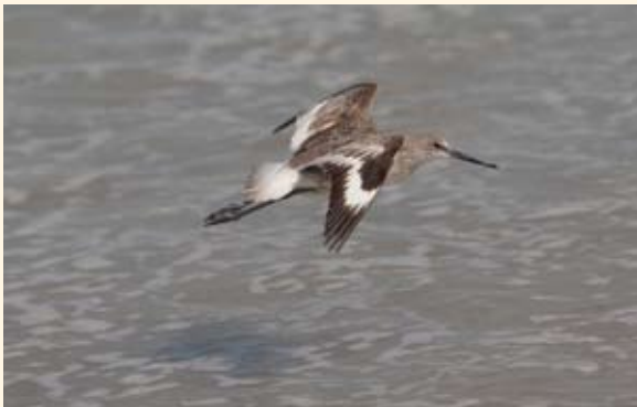
March's bird photo

This feature is only on the website and in the electronic version of The Flyer . The answer to this month's "puzzle" will be given in the next electronic newsletter, as well as on the website.