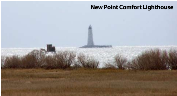
New Point Comfort Lighthouse

Not yet defeated by the wind and precipitation, the group proceeded to Bethel Beach, where flocks of Dunlins and Sanderlings and an occasional Black-belly Plover worked the shore. The appearance of two American Pipits and a