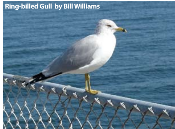
Ring-billed Gull