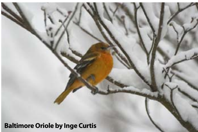
Baltimore Oriole by Inge Curtis