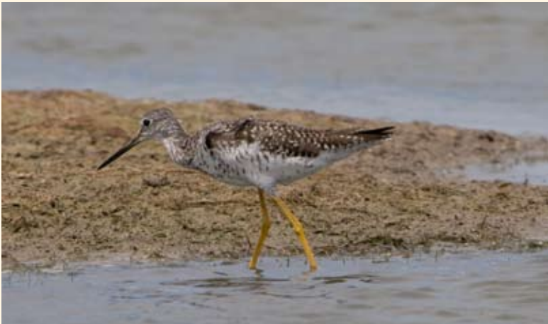
February's bird photo

This feature is only on the website and in the electronic version of The Flyer . The answer to this month's "puzzle" will be given in the next electronic newsletter, as well as on the website.