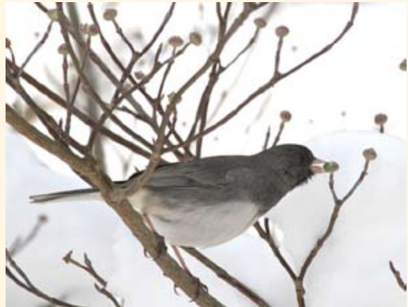
The Hermit Thrush, Dark-eyed Junco and White-throated Sparrow photos were taken by Inge Curtis. George Boyles took the photo of the "stars" of the New Year's Day Boardwalk Bird Show, the Red-shouldered Hawks.